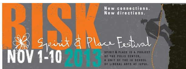
Figure 3: The 2013 S&P festival theme was “Risk.”

The most recent S&P festival presented the theme of “Risk” (see Figure 3). One of the new and unique pieces of this year’s festival was a “Competition on Race” (see Figure 4). As the festival organizers explained, it welcomed individuals and organizations from any sector and discipline, including artists and cultural leaders, faith leaders and congregations, educational organizations and scholars, civic organizations and social entrepreneurs. All were invited to submit original projects. Spirit & Place provided a platform on which, participants could dare to imagine a better life. 14