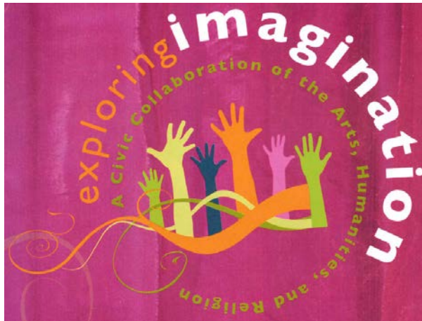
Figure 1: The theme for a recent S&P festival was “Exploring Imagination.”