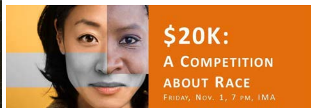
Figure 4: The 2013 S&P festival included an innovative “Competition About Race.”