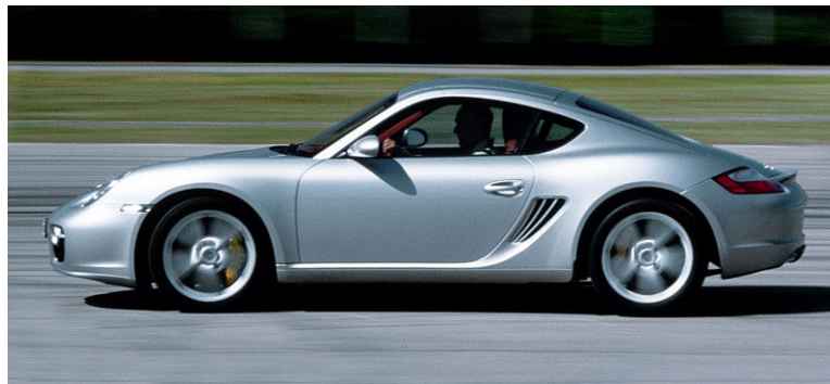
Figure 3: Porsche Cayman

Figure 3 shows the opening slide - that of the vehicle itself. The obvious point is to grab the students' interest and get some "wow, nice car" comments from them. The author would then ask if there's anything wrong with the car and likely get "nothing but that it's too expensive" as a response.