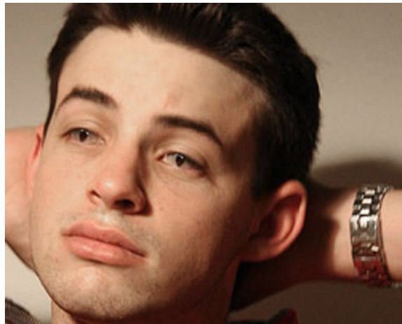
Figure 2: Vampire eyes

The next example is one that seems on the surface to be very off-topic. The reality, however, is that it can easily be related to dynamics and thus strongly delivers both entertainment value as well as a broader contextualization than the first example provided.