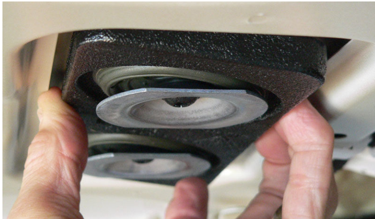
Figure 5: Trunk Spring-Mass damper