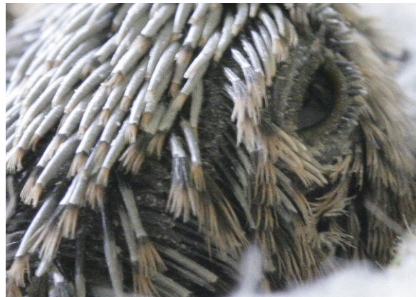
Figure 9: Hatchling Anna's

The picture in Figure 9 was taken some days later and shows an extreme closeup of the baby hummingbird's face. The quills that enclose the developing feathers are clearly visible, as are the different feather types on the head. Obviously, a discussion of feather morphology and evolution could easily occur at this point. Feathers are held in place by micro-barbules, and a discussion of this point could seamlessly segue to other naturally occurring micro and nano-scale structures, such as the nano-cilia that enable geckoes to walk up walls and which are being synthesized to produce new superglues.