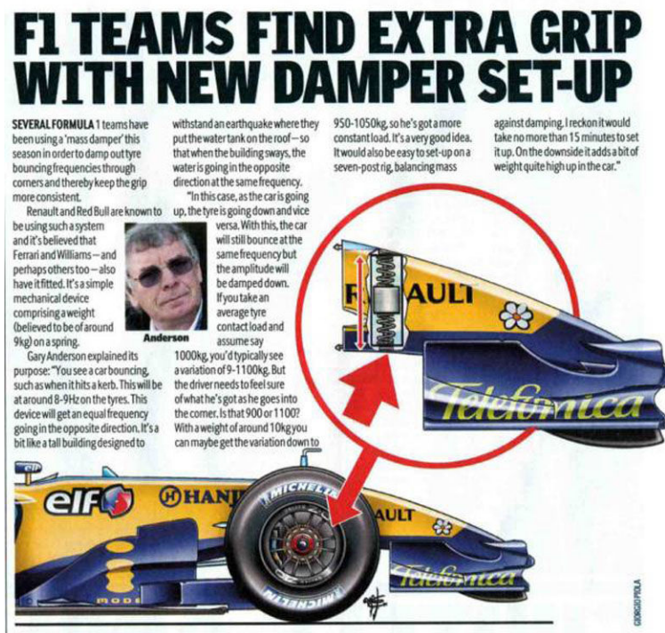
Figure 6: Mass Damper Controversy

Figure 6 shows that this example isn't limited to road cars. Formula 1, a sport that involves many millions of dollars, recently had a rules violation that garnered quite a bit of attention. Hopefully of great interest to the students is the fact that the system causing the controversy was conceptually identical to the one they saw in the Porsche Cayman. In the Formula 1 case the damper wasn't there to quell structural vibrations but rather to enhance the car's grip in corners.