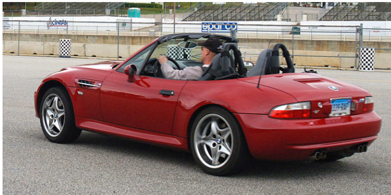
Figure 1: Initial acceleration of a vehicle

Our first example is very clearly tied to 2D dynamics and doesn't really require much in the way of explanation. This is not to say, however, that no commentary is given - quite the contrary in fact. The basics are that we're observing a sports car beginning to move forward. The particular car shown in Figure 1 (carefully chosen for the example) is a BMW M roadster. What the instructor would ask the class is whether they could tell that the car was accelerating forward, rather than braking, or perhaps just traveling at a constant speed.