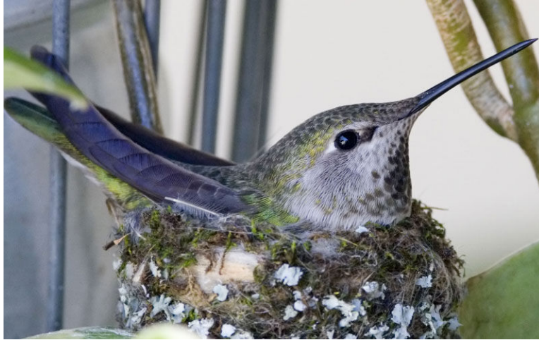
Figure 8: Nesting Anna's Hummingbird

The picture in Figure 9 was taken some days later and shows an extreme closeup of the baby hummingbird's face. The quills that enclose the developing feathers are clearly visible, as are the different feather types on the head. Obviously, a discussion of feather morphology and evolution could easily occur at this point. Feathers are held in place by micro-barbules, and a discussion of this point could seamlessly segue to other naturally occurring micro and nano-scale structures, such as the nano-cilia that enable geckoes to walk up walls and which are being synthesized to produce new superglues.