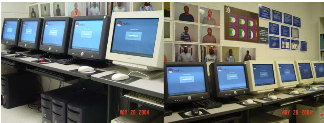
Figure 1. The High Performance Computing Laboratory at AAMU.

Under the support of DOE in 2003, AAMU was able to establish a high performance computing (HPC) laboratory using a cluster of Linux workstations. The HPC lab was enhanced through continuous support of DOE. Currently, the HPC lab has 8 high performance LINUX workstations, two Sun Ultra 10 workstations and one cutting edge high performance dual processor LINUX Workstations. All the operating system of Linux stations were kept maintained to the latest RedHat Linux with PVM package. All LINUX and Sun stations were equipped with FORTRAN and C compilers. In the past six years, legacy high performance computing codes, such as GENIE++, FDNS, WIND, RPLUS, and Burnett -3D (developed by current authors to compute transitional and micro-channel flow) were installed. Benchmark testing of these codes was completed. Figure 1 shows the setup of the HPC lab.