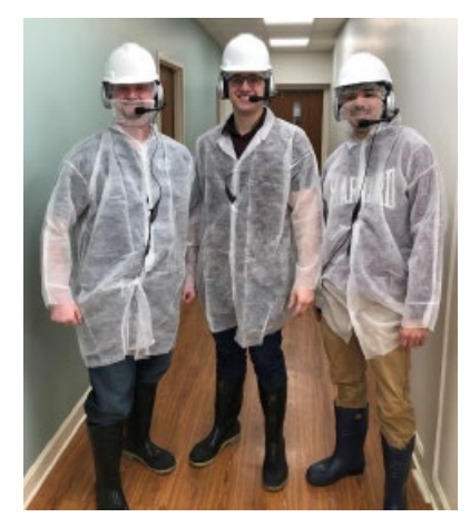
Figure 2: A Visit to Smithfield Foods

Participants went on field trips to engineering and industrial complexes. Figure 2 shows students visiting Smithfield Foods where they were able to see aspects of food engineering, including being led on to the meat processing floor. During the field trip, they met with different types of engineers who explained their job functions.