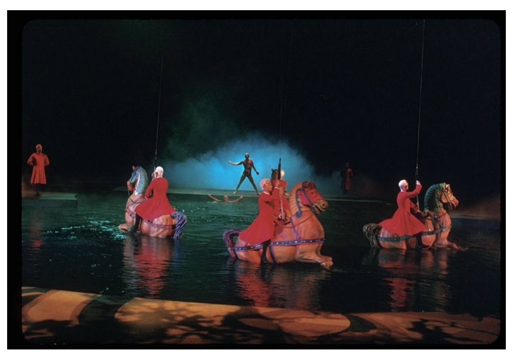
Figure 2. One of the sequences in the "O" show at the Bellagio that involves many underwater mechanisms to achieve the desired effects.

Figure 1. A modern lifting/traversing unit developed by Fisher Technical Services of Las Vegas for a live entertainment venue is shown.