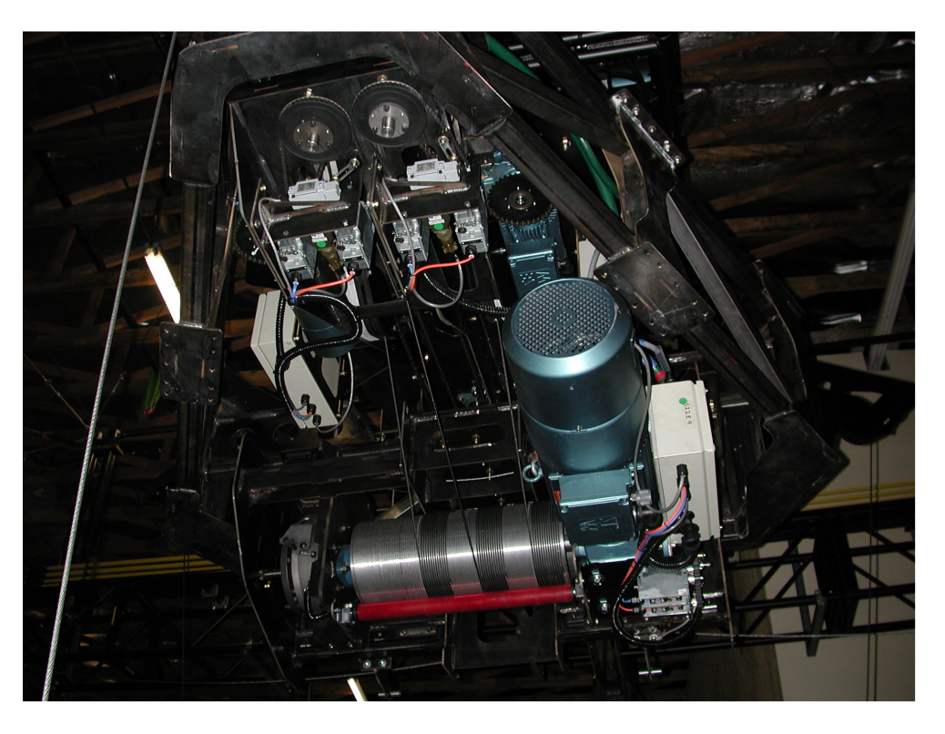
Figure 1. A modern lifting/traversing unit developed by Fisher Technical Services of Las Vegas for a live entertainment venue is shown.