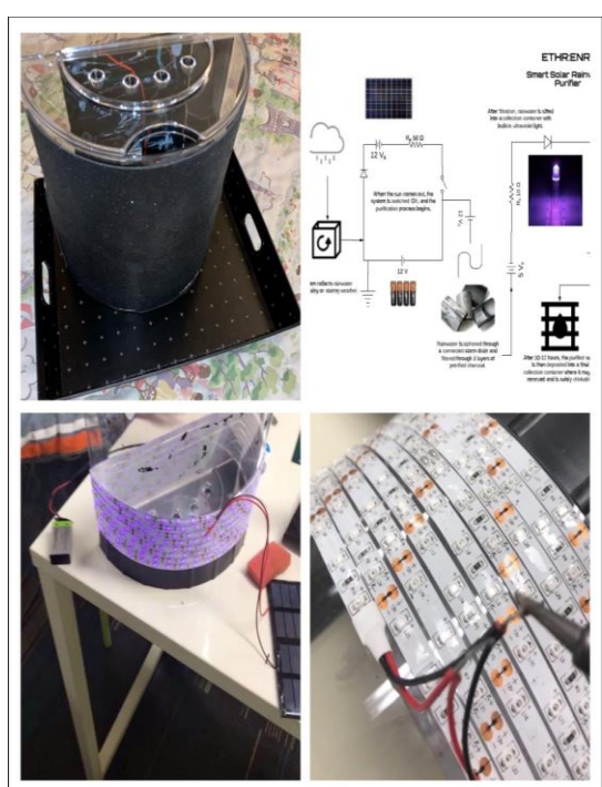
Figure 4: ETHR-ENRG Smart Solar Rainwater Purification System With Circuitry Design

The design above is wired using a 12-volt solar panel with the soldered on positive and negative wires directly soldered to the positive and negative wires on the string of ultraviolet lights and the battery backup is spliced with the other end of the wires from the string of ultraviolet lights and