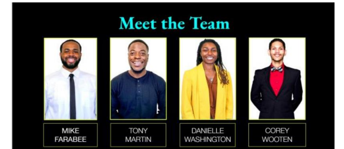
Figure 6: We Are ETHR-ENRG!