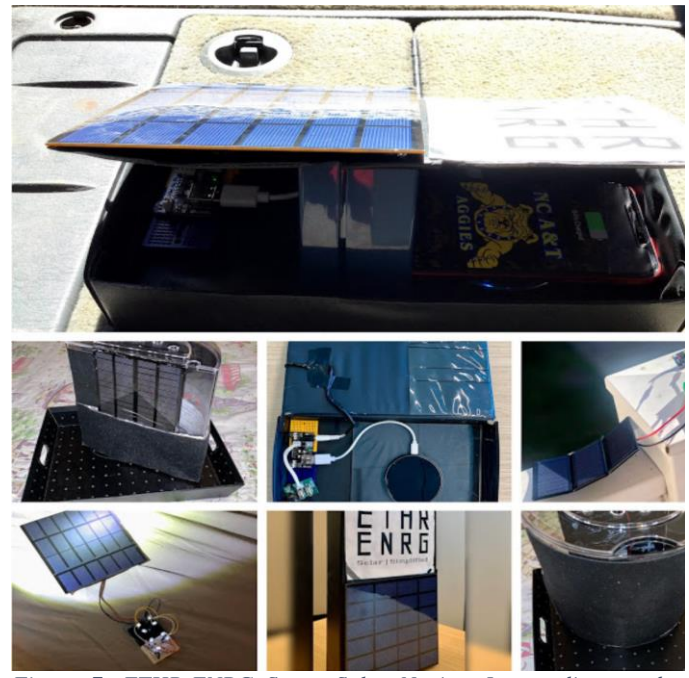
Figure 7: ETHR-ENRG Smart Solar Novice, Intermediate, and Advanced Project Kits Assembled And Working Properly