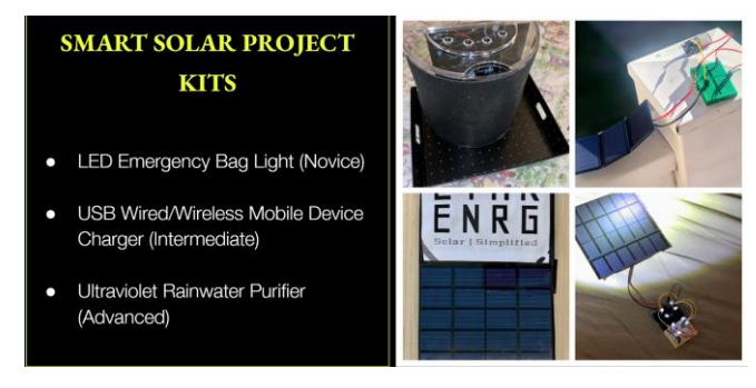
Figure 5: ETHR-ENRG Smart Solar Novice, Intermediate, and Advanced Project Kits

With the advancement of solar energy, we are confident our Solar Energy Project Kits will be beneficial to those who want to learn more about solar energy and its benefits. The future is solar!