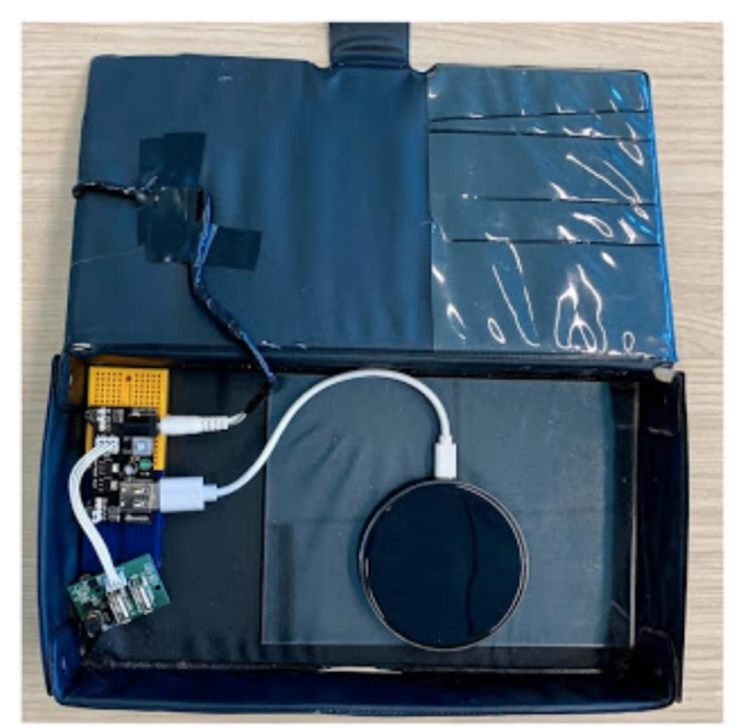
Figure 3: ETHR-ENRG Smart Solar USB Wireless Mobile Device Charger.

The design above is wired using the 3 solar panels in parallel with the positive and negative wires connected to a miniature project breadboard, with positive and negative wires from the breadboard respectively being soldered to the USB chip's positive and negative terminals. The battery backup is also wired in with the circuit on the miniature project breadboard.