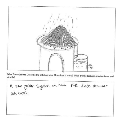
Figure 1: Example Idea Sheet from Rainwater Catcher Context

Researchers and designers have offered many competing strategies for improving the effectiveness of ideation sessions. Brainstorming, a group ideation method intended to produce many ideas, is frequently used and studied<sup>3</sup>; however, instructions designed to improve brainstorming and increase idea quantity have proven unreliable<sup>4</sup>. Alternatives to brainstorming such as TRIZ or "brainwriting" promote different outcomes. TRIZ asks designers to consider the principle issues of a problem and then adapt previous concepts that addressed similar issues<sup>5</sup>, whereas "brainwriting" encourages team members to record their own solutions separately to prevent group criticism or pressure during brainstorming sessions<sup>6</sup>. Each of these techniques has both benefits and drawbacks depending on the problem, the participants, and the overall problem solving process involved. Because these strategies have varying and subjective impacts on concept generation, a formal and more objective approach is needed. Measuring the quality of ideas using metrics is one means of evaluation.