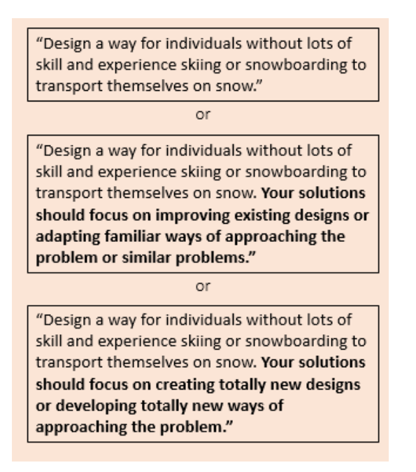
Figure 3: Problem Framing in the Snow Transporter Context<sup>12</sup>

Problem Framing was the last intervention used in this research. Using the Design Problem Framework<sup>12</sup>, three sets of instruction were created for each problem context. For instance, for the snow transporter problem context, participants were instructed to use one of the three preprepared prompts shown in Figure 3<sup>12</sup>. The first prompt uses neutral framing; neutral framing refers to the basic criteria of a problem context and has been shown to encourage participants to generate ideas using their preferred, natural approach. The other two prompts utilize problem framing, as written in bold text. The second prompt focuses on modification and progressive design using adaptive framing. These prompts are framed to emulate Kirton's Adaption-Innovation Theory, which models the continuum of cognitive style<sup>13</sup>. Problem framing as an intervention has been studied previously with regard to an individual's cognitive style and perceptions. A goal of the current research was to study problem framing using the actual outcomes instead of individual perceptions.