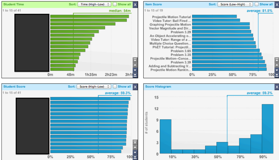
Figure 1: Default Diagnostics View for an assignment in MasteringPhysics

Figure 1 shows the default Diagnostics View for an assignment in MasteringPhysics. Starting in the upper-left hand corner and moving clockwise we are presented the time students spent on the assignment, the average score for each item in the assignment, the assignment score by student and a score histogram. By clicking on an assignment item, the wrong answers given by students is displayed along with a break down of how many students succeeded in answering the problem with a comparison to all students using MasteringPhysics as shown in Figure 2.