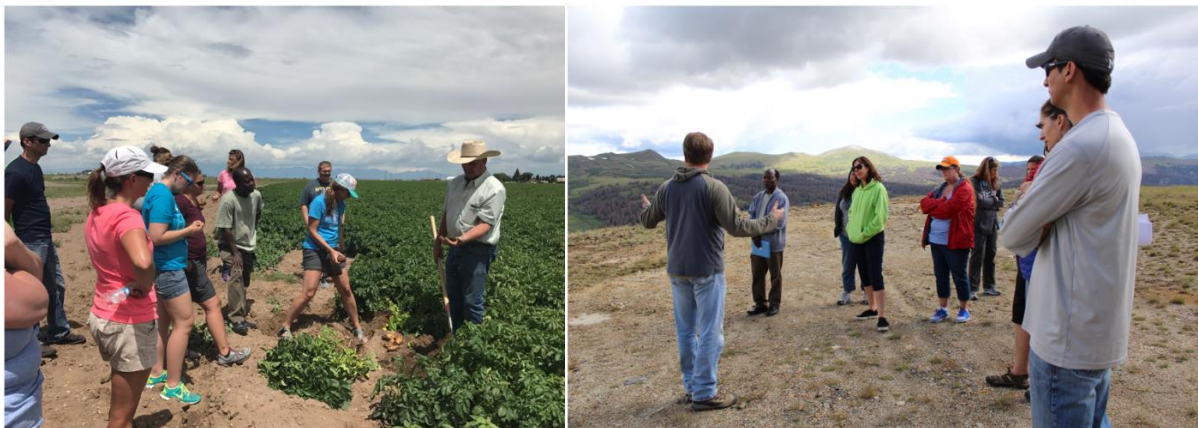
Figure 2 – Photos from the 2017 WE 2 NG Extended Field Trip.

The WE 2 NG program seeks to infuse current water-energy research into K-12 classrooms through collaborative partnerships between CSM researchers and local K-12 STEM teachers. The specific program objectives are to: 1) impact teacher participants by increasing their knowledge of the water-energy nexus and by expanding their perspectives on science, engineering, and research, 2) indirectly impact K-12 students' learning, motivation, and engagement by increasing teacher passion and awareness and by providing mentors from CSM in the K-12 classroom and 3) to impact K-12 STEM curricula via the creation of standards-based active learning lessons infused with current research which will be available through local, regional, national, and global forums.