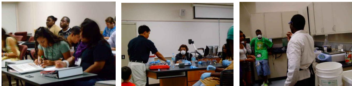
Figure 4. Students taking SAT math practice exam, students performing water filtration project, and students learning about sample truss bridge project, respectively.

The Applied Mathematics SAT Prep Summer Program was structured around several disciplines within engineering. There were different components to the program including a civil engineering component, a bioengineering component, and an environmental engineering component. To bridge the connection to engineering and students' high school courses, the summer program also had a math component and an SAT preparation component. Figure 4 was a photograph taken during the Applied Mathematics SAT Prep Summer Camp.