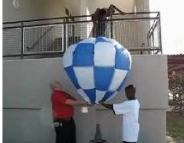
Figure 3. A Middleton aerospace tech student launches the hot-air balloon

accomplish tasks, like sweeping Lego blocks across a table. Then they compete against each other in two-minute matchups to see whose design and programming — and math skills — are the best 6 . One of the students launches a hot-air balloon he constructed with tissue paper (see Figure 3)