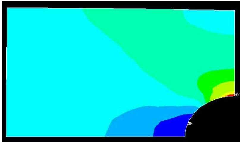
Figure 2 – Model of Axial-Loaded Plate using Symmetric Boundary Conditions

The solid modeling portion of the course is extensive. Students are taught how to generate complex shapes using fillets and holes. They learn how to control the automatic meshing to decrease the element size in high stress areas. They learn how to check that they have an adequate mesh density. The use of symmetric boundary conditions to reduce model size is introduced, Figure 2.