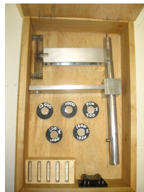
Figure 3. Student Demonstration Kit, Disassembled