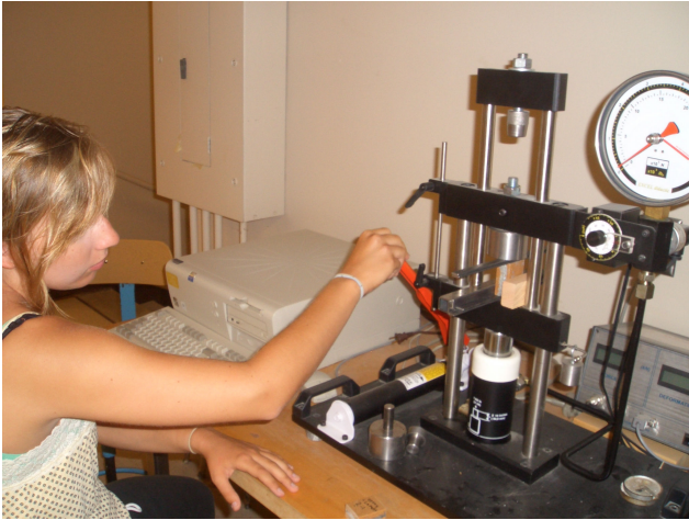
Figure 1. Shear Testing of Composite

data on the mortar between two wood/plastic tiles. ASTM standards may or may not exist for such tests, thus engineering creativity is once again encouraged.