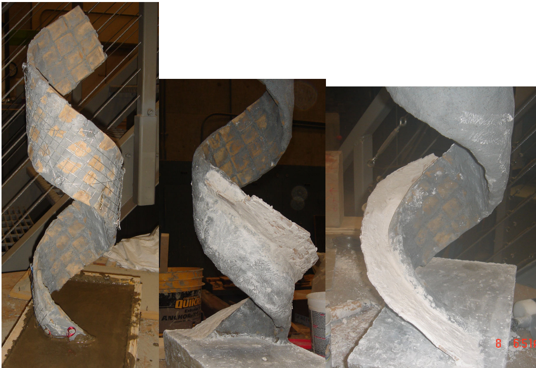
Figure 4. Benchtop Scale Spiral Staircase Made of Composite

Figure 4 documents some of the progress made during the construction of a spiral staircase formed from this material. The total height of the model was approximately one meter.