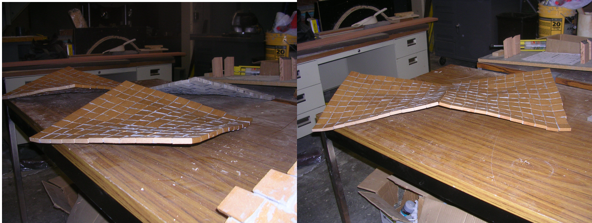
Figure 3. Modular Hyperbolic Paraboloids Made of Composite

Figure 3 shows modular units of hyperbolic paraboloids made from these wood/plastic composite tiles. The student doing this research was interested in the constructability issues surrounding this material.