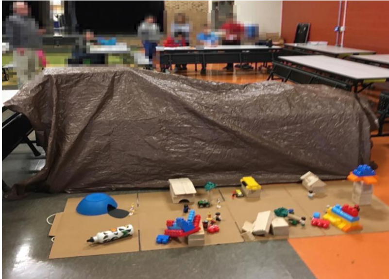
Figure 3: Disasterville scenario of a town hit by a tornado

The final activity was a UAV race challenge. In this activity, youth had to deliver small buckets representing water to a designated landing zone target near Disasterville. Youth once again were supplied with pipe cleaners and rubber bands and the like, which they used to design and build a skyhook to hold the bucket during the aid flight. Designs need to balance the requirements that the buckets remain attached during takeoff and the flight to the landing zone but must allow the bucket to detach when the UAV touches down in the landing target without any further human intervention. Once youth were able to design skyhooks using craft materials, they were asked to choose 3D printed models of skyhooks. Based on their prior experience in designing skyhooks youth had to decide which 3D skyhook they would attach to their UAVs and use in the race.