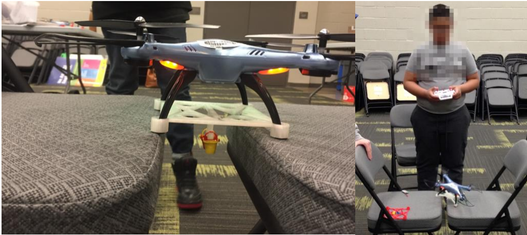
Figure 5: (a) 3D printed skyhook with supplies attached, (b) Youth testing the 3D printed skyhook

The project artifacts collected also support this finding of improvement in youth designs, they made sketches of the skyhooks before designing them. Also, during the UAV race when youth had to choose from multiple 3D printed skyhooks (Figure 5(a), 5(b)), they kept in mind their prior knowledge in designing skyhooks like distribution of weight, battery life, shape of hook, etc.