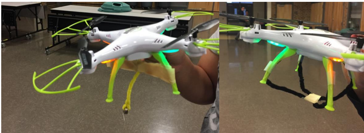
Figure 4: (a) Design of a simple skyhook, (b) design of a more complicated skyhook to distribute the load

whenever youth had the opportunity to design/choose attachments for the UAVs. Specifically, youth were engaging in more testing of specific designs, more iterations of their designs, and ultimately creating more sophisticated designs in this implementation. For instance, youth were augmenting their UAVs with multiple skyhooks, distributed over each of the 4 wings, and using weights to keep the UAVs balanced during flight (Figure 4b). While, in prior iterations youth had much simpler designs involving only a single hook (Figure 4a). In earlier versions, youth were limited in their ability to iterate due to the short durations of each session (45 minutes to one hour); however, interviews with youth in earlier iterations also revealed that they were not motivated to iterate as they perceived their designs as “good enough.” In this implementation, we found youth actively engaging in adding new constraints to their designs after testing them out and changing their designs to optimize them. For instance, when surveying the Disasterville town, youth had to attach a camera to the UAV in such a way that they get the best footage of the town. Youth kept checking the best camera angle, the most feasible camera position and each time they tested their design by flying the UAV over Disasterville until they were satisfied with the video footage.