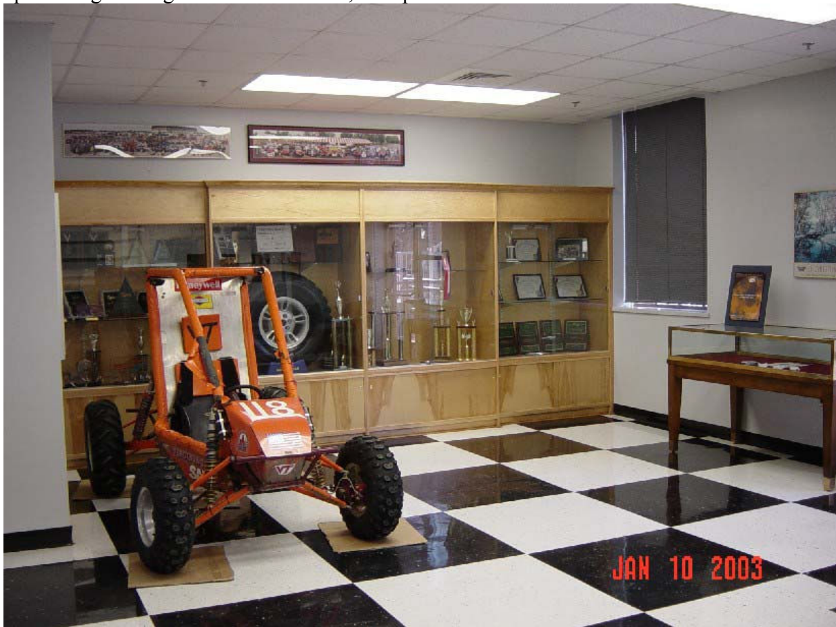
Figure 4: Showroom with trophy case and project display

believe that it gives them a leg up on the competition, which it does. They are also willing to put in the time to keep it looking first class. As alumni, they are successful in convincing their employers to donate materials and components, and they also occasionally send donations. When they come back to campus as recruiters for their companies, they always want to talk to the students in the lab, and those students are often the first to receive offers, because employers know that they not only understand the theory of engineering, but that they can also put it into practice. Figure 4, the showroom with the trophy case and a project or two on display, is the normal entry into the lab for visitors, so they see from the outset that performance, along with the required engineering and documentation, is important.