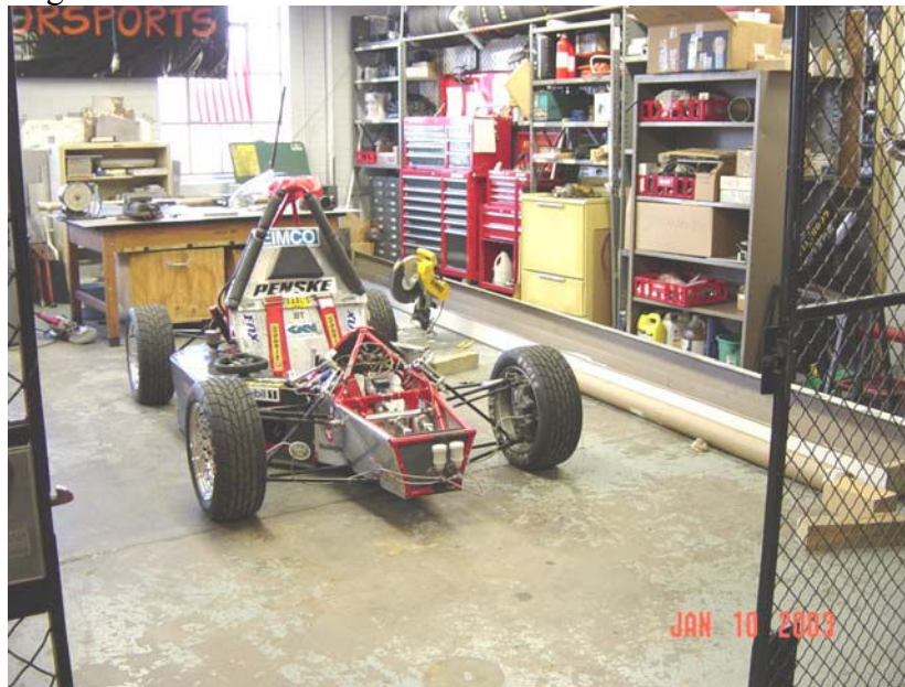
Figure 3: Typical work bay

The resulting space, with the industrial cage material used for bay walls, has proven to be quite functional. Although it is possible to climb over the cage from one bay to another, we have no evidence that this has happened. Students tend to respect the space of the other groups as they would have their own space respected. We decided to install double wide sliding doors on all of the work bays to allow moving relatively large objects in and out of the bays. One of the work bays is shown in Figure 3.