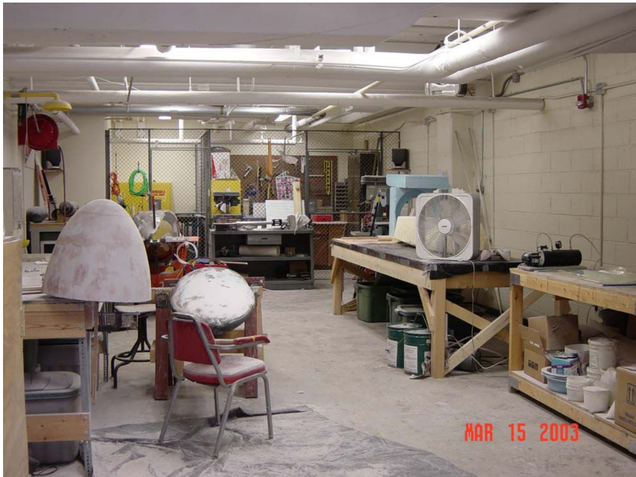
Figure 5: Shop for dusty/smelly project work

approximately 1,000 square feet of additional space downstairs in the same building to meet that need. The university facilities department designed this laboratory to have considerably more ventilation than the main facility to make it safe for conducting work that was dusty and/or smelly. Students are required to wear whatever protective gear (gloves, respirators, etc) is appropriate when performing work in the downstairs area. Cleanliness rules are also in effect in that lab, where buildup of dust of various kinds could pose considerable health hazards. The renovation of that space cost approximately $60,000, which the dean provided. The downstairs laboratory is shown in Figure 5.