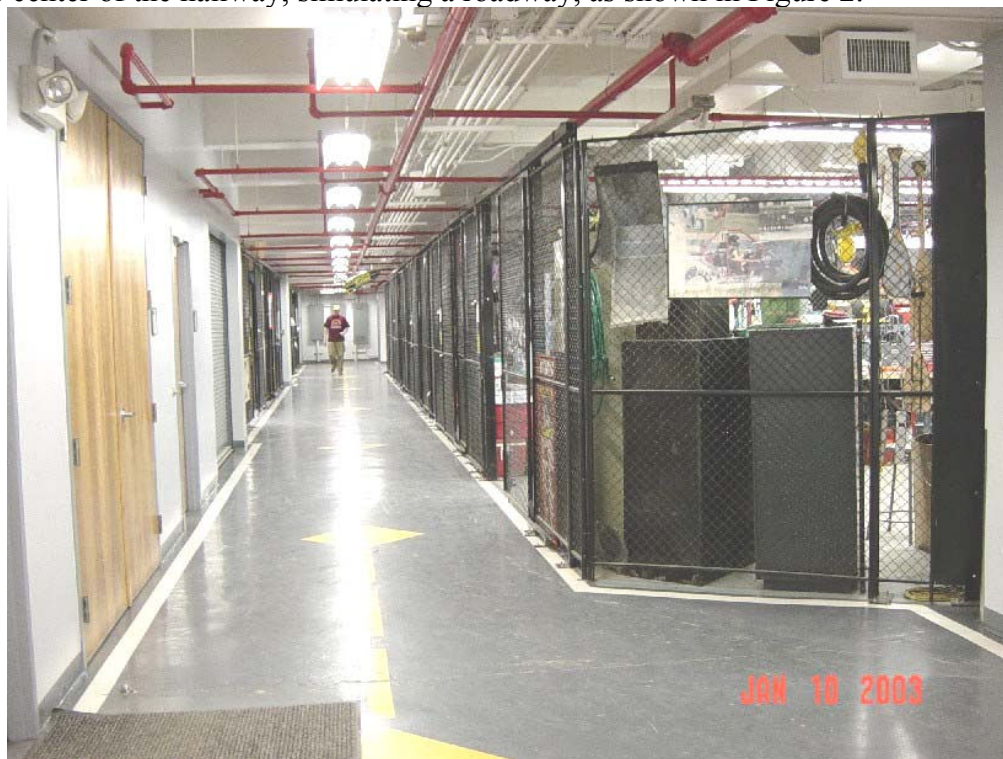
Figure 2: View of hallway with work bays on either side

Anyone who has dealt with renovations knows that there are a multitude of problems that arise, and this project was no exception. Although the architects did a reasonably good job of facility design, there were several instances when their opinions differed from ours. One example is that since many of the projects were automotive, the architects wanted to put some lamps that looked like streetlights along the central hallway, along with some creative, but seemingly frivolous, helical stripes on some of the interior columns. In the end, we did agree to a yellow dashed line down the center of the hallway, simulating a roadway, as shown in Figure 2.