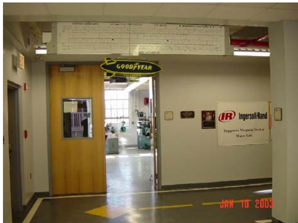
Figure 8: View from lobby to machine shop