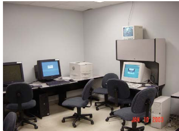
Figure 9: CADD Lab