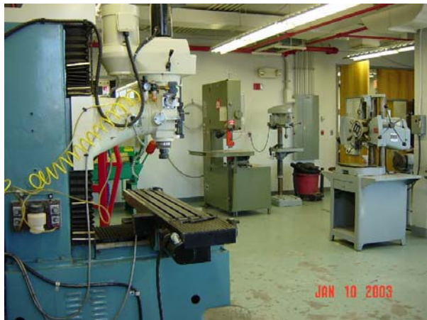
Figure 6: Partial view of the machine shop

Below are a few additional photographs of parts of the Ware Lab.