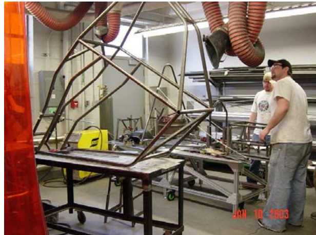
Figure 7: Half of the welding shop