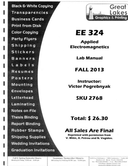
Fig. 1. Lab manual for the experiments developed for the Applied Electromagnetics course.