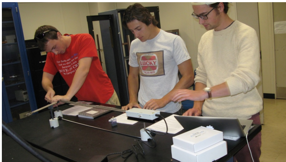
Fig. 3. Students working with experimental setup for study of EM wave propagation on a transmission line.