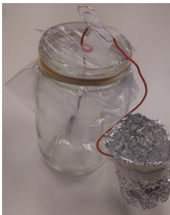
Fig 1 – Faraday's Ice Pail

Electric Fields & Charges – When someone thinks about electrostatic electricity experiments, perhaps what comes to mind are images of sparks and Van der Graaf generators and hair standing on end. In developing our lab activities in electrostatics, we focused more on exploring foundational concepts and applications. Standard classes in electromagnetics start the discussion of electric fields by covering electrostatic topics, including Coulomb's Law and Gauss's Law. In an introductory lab activity, students begin by performing calculations involving Coulomb's Law and Gauss's Law. Then, MATLAB is used to create simple electric field plots. Then, for the hands-on portion, students perform a simple observation of electric charge by charging a small piece of metal hanging from a string and observing repelling/attractive behavior with a plastic rod. Next, students construct a simple electroscope (simple electrostatic observation device where two metal 'fins' repel each other when charged). Finally, students use this electroscope to perform Faraday's Ice Pail experiment. Here, students use a small metal cup and a charged device, where the cup is attached to the electroscope, to make observations about how the charged device interacts with the cup. Discussion questions are used to tie their observations from this experiment to the better known Faraday cage and the frequently used Faraday bag, better known as the silver bags used for shipping electrical components. [5]