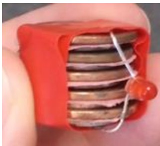
Fig 2 – Simple 'Penny' Battery

How Do We Get Current Anyway? – In this lab activity, students explore some simple concepts of electrical power generation. Calculations involve the current density vector, which is covered in class prior to this lab activity. Then, students perform a calculation using Matlab. Next, for the hands-on portion of the lab activity, students start by creating a simple 'penny' battery, which they use to light an LED. Next, students use a simple generator (made of a nail, 2 magnets, a cardboard 'frame', a string, and magnet wire) in order to light an LED (in next year's version, students will construct their own generator instead of using a pre-made one). These two activities are especially useful in contrast to each other because these are very visual demonstrations of DC versus AC power generation. Supporting questions involve basic concepts of generators and batteries. [6]