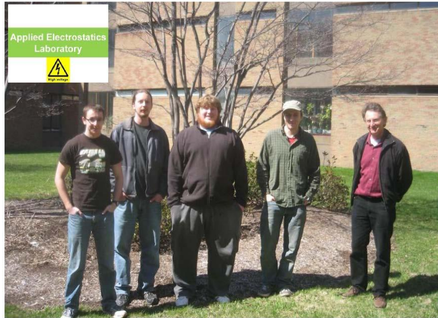
Fig 4. Students and instructor outside the laboratory building

Attempting to measure the corona and electro spray currents in magnetic field turned out to be ineffective due to the small nature of the currents (in the range of nano to micro amperes) and the large electromagnetic noise in the room. After making the necessary arrangements, the system was moved in an anechoic chamber available in the department where experiments and measurements could be performed.