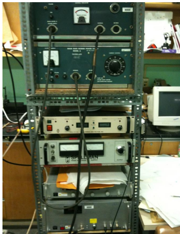
Fig. 3 a) Student working in the lab on crystal synthesis by means of electro spray; b) the high voltage module.

Moreover, with the recent purchase of a research-grade SEM (not available at the time of the project) the opportunities in this direction are countless. Each project, given enough time, could potentially be developed into a master's or doctoral research.