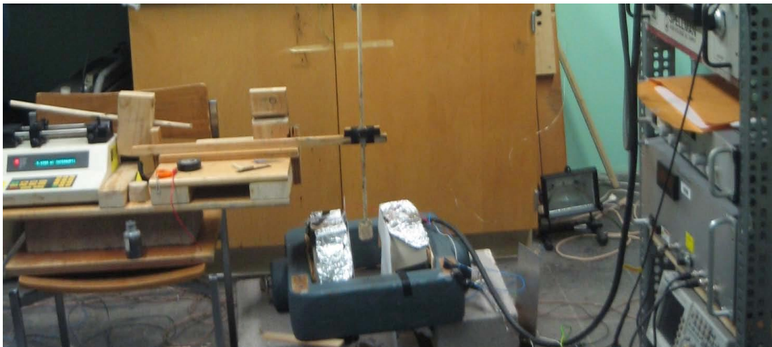
Fig. 2 Setup using an electromagnet for controlling the electrospay.

Upon two weeks of general research and familiarization with the lab equipment and capabilities, students were interviewed in an informal manner and specific projects were assigned to each student; also, a plan of investigation was spelled out in consultation with the instructor. No specific textbook was used, but many research articles were customized to the area of research preference specified by each student. The course was assigned a specific time for students and instructor to usually meet in the lab, work on specific tasks, and exchange ideas. Each student had a lab key and could access the lab independently. Individual projects were approved: