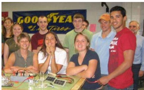
Figure 1. Hands-on learning with fuel cells.

In the first week, the fuel cell group gathered to investigate the relevance of their research in a global context. The group discussed available energy options, pros and cons, and the implications of the dependence on foreign oil. Two videos were shown, Earth's Clean Energy Destiny (2000) and The Hydrogen Age (2005). The history of the fuel cell was explored to lead into the next activity. A hands-on fuel cell laboratory experience enabled the students to more fully engage with and appreciate the processes as they used solar energy to hydrolyze water which then powered small circuits (Figure 1).