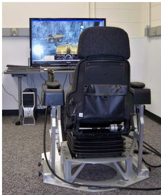
Figure 1: Caterpillar VTS Large Wheel Loader Model

The large wheel loader model was used in this study. A Caterpillar 992G wheel loader operating in a rock quarry is simulated. Various simulation modules are included and designed to allow the operator to become familiar with the loader controls, maneuvering the loader and bucket, stockpiling operations, load and carry operations, and truck loading operations. The VTS large wheel loader model is shown in Figure 1 and the operator seat and controls are shown in Figure 2.