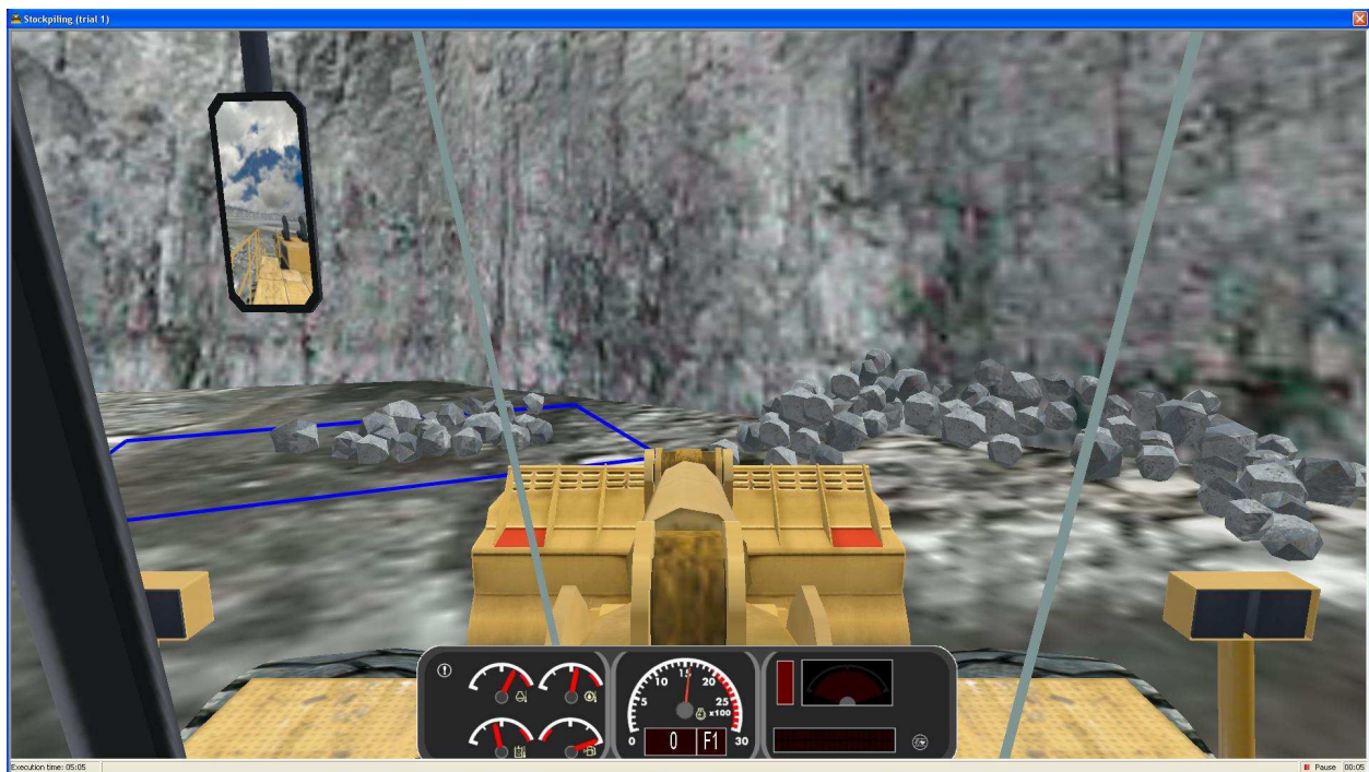
Figure 3: Caterpillar VTS Stockpiling Operation

The operator's view from the simulated equipment cab during the stockpiling operation is shown in Figure 3.