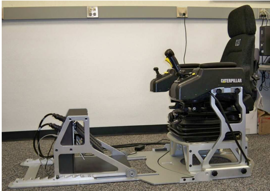
Figure 2: Caterpillar VTS Large Wheel Loader Operator Seat and Controls