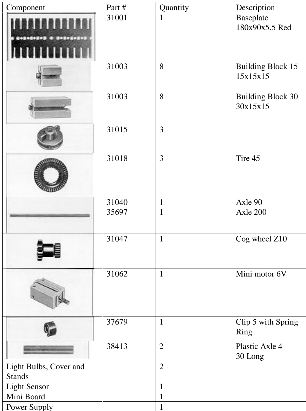
Figure 3: Component list for the Smart Car