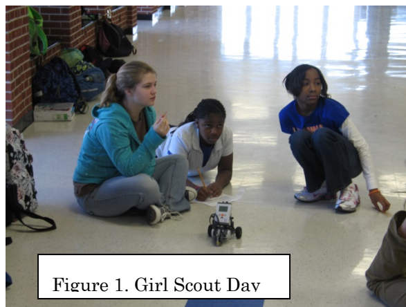
Figure 1. Girl Scout Day

The room is filled with noise, as a dozen or more middle school-aged Girl Scouts in one corner try to “scream” their racing robots across the finish line, driven forward by programmed responses to microphone inputs; while, in another room a second group is quietly experimenting with the effects of environmental pollution and deforestation, as their robotic “creatures” respond with increasing distress to the removal of protective plant life. Elsewhere, another team investigates a LEGO™ robot’s ability to negotiate an incline when given various surface treatments. The engineering undergraduates coaching the Scouts through the morning’s events are all smiles and obviously proud of the Scout’s accomplishments as they rotate through the morning’s merit badge stations.