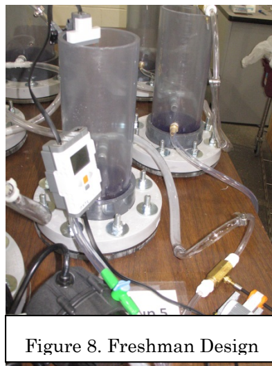
Figure 8. Freshman Design

For example, one student team designed a “batting machine”; another designed a “soda dispenser” that would pour a precise amount of soft drink into a waiting cup. This “whole process” approach to STEM subjects brings learning full circle by showing the learner how the result from a given experiment can be used to accomplish a real world task. From a chemical engineering perspective, some of my freshman chemical engineering student teams have designed a system to measure and maintain tank level (Figure 8) with inflowing and outflowing