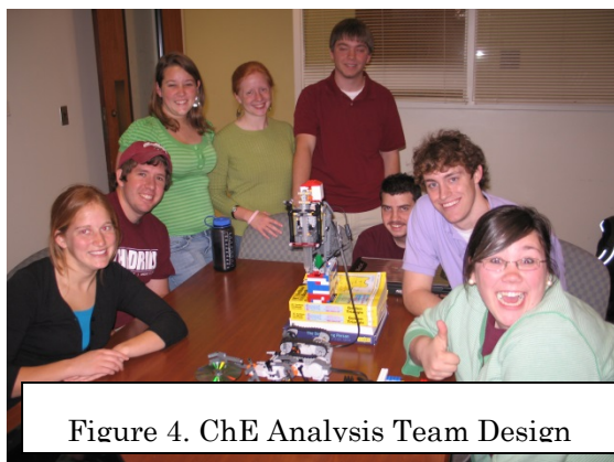
Figure 4. ChE Analysis Team Design