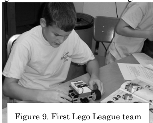
Figure 9. First Lego League team

In post-activity surveys, students, teachers, parents and administrators alike have responded enthusiastically to our outreach activities—many asking us to enable them to bring such advanced technology and training to their classrooms. Mississippi perennially ranks at or near the bottom of most statistical measures regarding educational expenditures per pupil. For many schools, this type of robotics/sensing technology is out of reach financially. Yet, we believe that sustained contact with schools and community venues through our outreach program can contribute to increasing the recruiting of students to engineering and science career preparation by combining sustained coaching and modeling with an integrated technology and an equally integrated curriculum spanning STEM subjects.