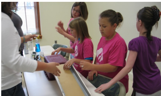
Figure 6. Girl Scout Merit Badge Day

The School of Chemical Engineering K-12 outreach program has grown, in part, out of my own personal experience engaging my children in STEM-based activities during their middle school