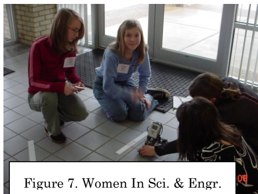
Figure 7. Women In Sci. & Engr.

teaching various Microsoft Excel® and Visual Basic techniques, the Analysis course is focused on preparing students for the extensive use of these tools in later courses and in the chemical process industries. I personally found the method of working through spreadsheets in “real time” tedious and stifling to class dynamics. “Now class, if you will notice, as I execute this formula in cell ZZ149 how it changes the results in cells A45, D15 and R73...” (you get the idea). I considered a better approach—putting these tools into an “as needed” context with hands-on engineering design problems.