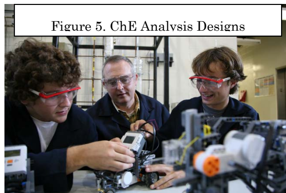
Figure 5. ChE Analysis Designs

Robotics technology enables teachers to elicit creativity and critical thinking from students by drawing on students’ curiosity towards unknown, yet approachable physical systems. 25, 27-29