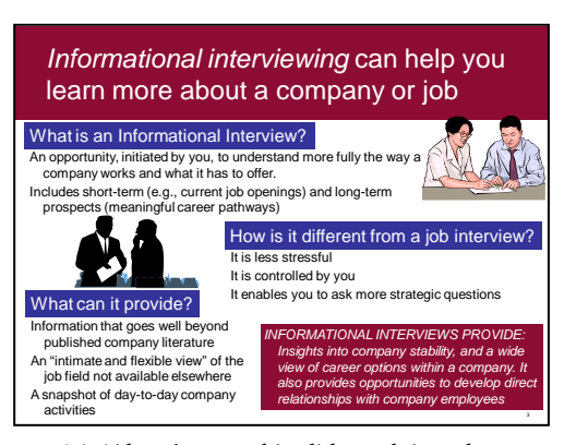
(c) 'About' page; this slide explains what Informational Interviewing is and why it is important