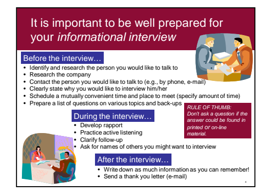
(d) 'To do' page; this slide portrays what the interviewee should do for an informational interview