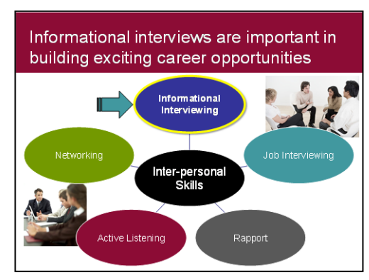
(b) Orientation page; this shows where informational interviewing fits in with other inter-personal skills