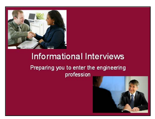
(a) Title page; this is a sub-topic of the 'Interviewing, Networks, and Building Relationships' "Full" module