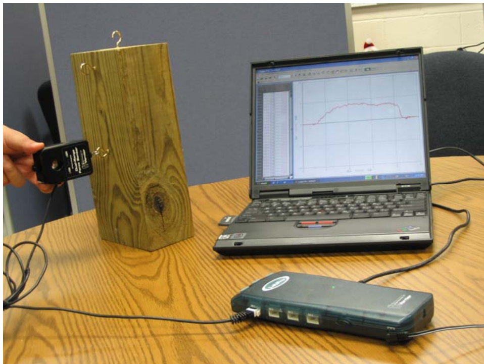
Figure 1—Stability test: finding the force required to slide or overturn the block