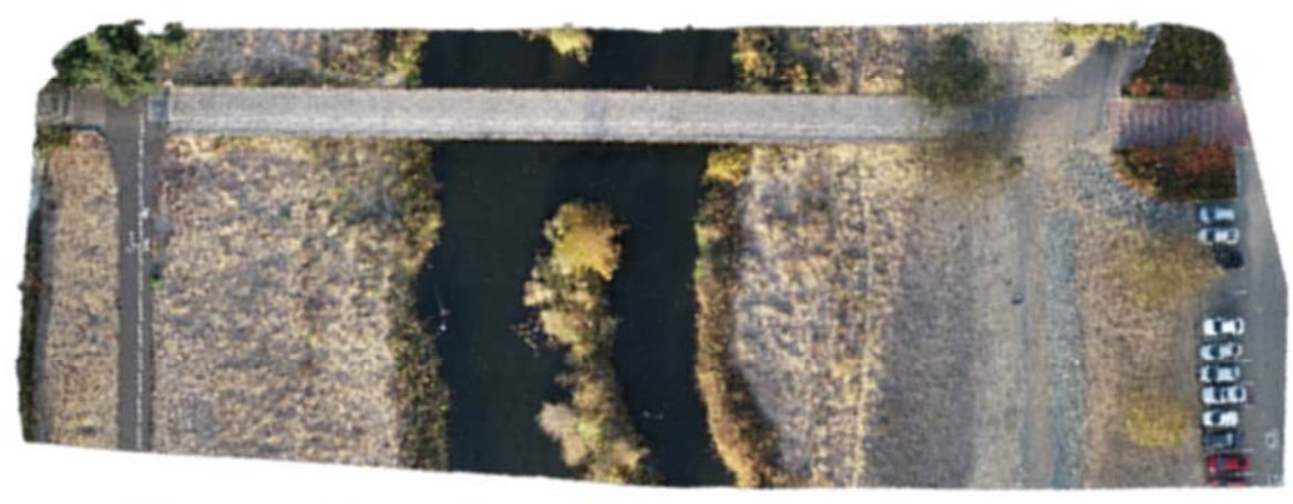
Figure 1. Map of the Calaveras River on the University of the Pacific campus created using 100 UAV images and five ground control points.

In addition to positive aspects of the activity, there were several challenges encountered. The most significant challenge was in using the GPS equipment. The first author encountered issues with the GPS equipment on the day of the activity, delaying collection of ground control point data. This issue has since been remedied by additional training on the instrumentation. Instructors planning to integrate this activity into their own courses are advised to become very familiar with the GPS equipment in advance.