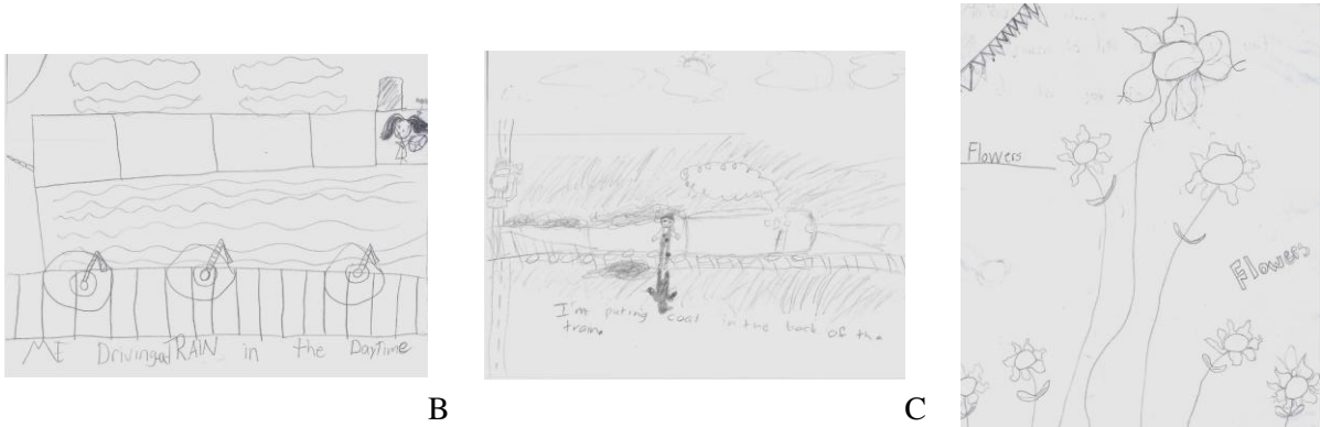
A B C Figure 2: Engineering illustration by student not exposed to Engineering Elephants . A. Text reads “Me Driving a Train in the Daytime”, B: Text reads “I’m putting coal in the back of the train”, C: Text reads “Flowers—An engineer is like someone who grows something”