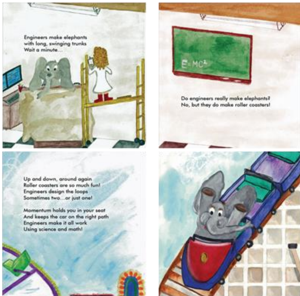
Figure 1: Excerpts from Engineering Elephants that illustrate the interactive, engaging presentation of engineering concepts tailored to young ages.

While our initial intent was for Engineering Elephants [18] to be shared by parents with their children (i.e., specifically targeting 2-7 year olds), we have found it plays a significant role when directly integrated into a classroom. A school district in West Texas designed elementary summer school curricula using Engineering Elephants [18] as the centerpiece. Because of the multifaceted concepts presented in the book, Engineering Elephants [18] served as a jumping off point for educators to create literacy rich curricula centered on their core STEM requirements. In particular, 3 rd -5 th grade summer school students (i.e., ranging in age from 8-12 years) in Slaton Independent School District (ISD) (Slaton, Texas) showed an estimated 80 % improvement on their practice Texas Assessment of Knowledge and Skills (TAKS) science tests after having Engineering Elephants [18] integrated into their summer school curriculum [23].