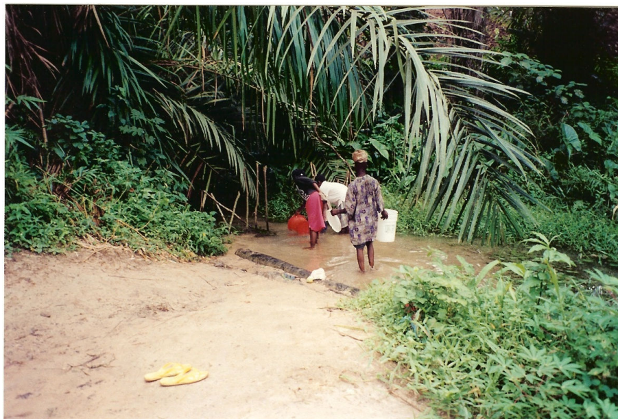
Figure 2. Water supply at Umuluwe, Nigeria.

At this point, students learned about drinking water standards and methods to determine water quality from an expert in the field. Students would have the opportunity to consult with this expert outside class and on a subsequent lecture once they have had an opportunity to apply this new information to their own project. As part of this initial stage, teams identified their potential customers, conducted an analysis of customer needs, and performed a study of past work. The instructor provided a list of acceptable materials for the construction of the system prototype.