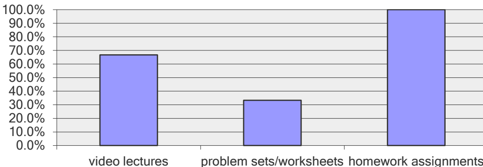
Table 2 Helpfulness of Summer Bridge Course Instructional Tools in Learning Math

Several students elaborated on the most popular response, homework assignments as most helpful in learning math. They indicated that the homework assignments were helpful because it gave them a chance to practice what they learned in the problem sets/worksheets. To a lesser extent, students enjoyed the homework assignments because they provided an opportunity to practice what they learned by watching the video lectures. The only negative reaction to the homework assignments was reported by three students who stated that they did not feel connected to the material in the homework assignments.