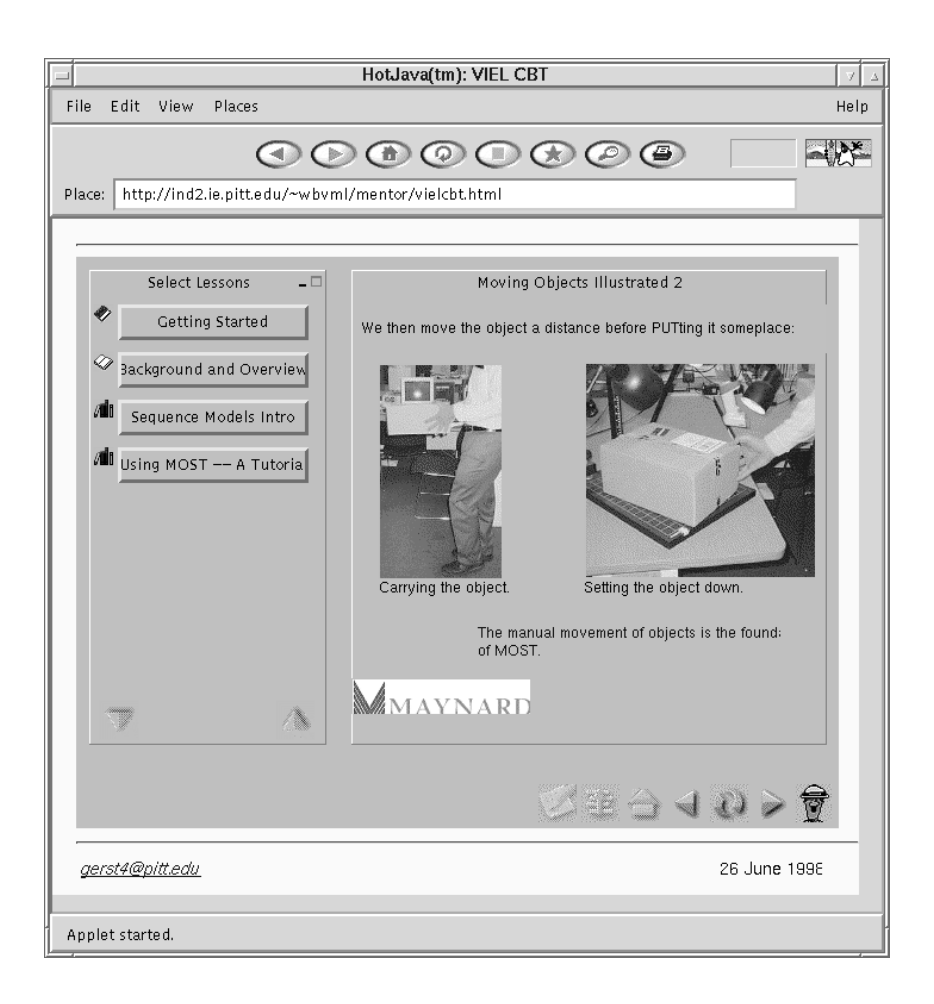
Figure 2 Client applet displaying lesson selections and media content

Additional functionality of the Java client illustrated in Figures 1 and 2 should include, but is not limited to, prerequisites processing, progress status reporting, a collection of assessment question types with per-item record tracking, and hot-button processing to include opening new browser windows and calling Java methods.