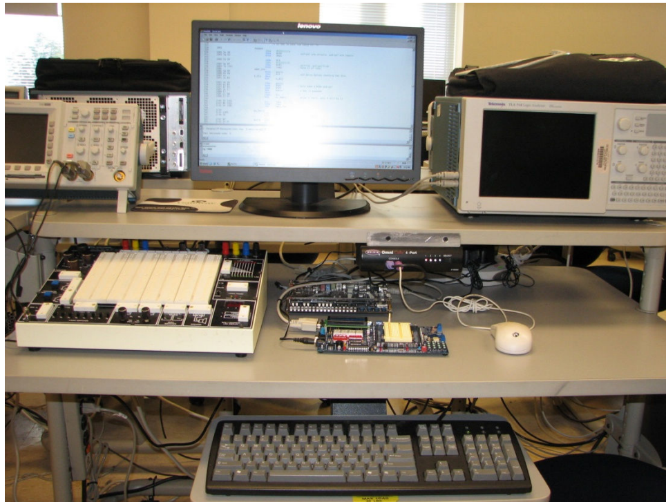
Figure1. Microcontrollers Workstation

The laboratory for this class counts with 20 workstations that can be used by the students to write, test and implement their projects. The workstation setting is shown in Figure 1.