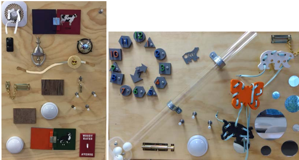
Figures 1 & 2: Example therapy boards from Spring 2017

customized work. Figure 2 shows another student's work. Again, most parts were off the shelf, though the student did produce a clock from 3D printed parts and animal shapes using a CNC router. It is important to note that this original project was coupled with a second project modeled after The Ohio State University's Toy Adaption Program, which aims to modify electronic toys for use by those with physical limitations. 6 Thus, there was limited time to produce truly custom products.