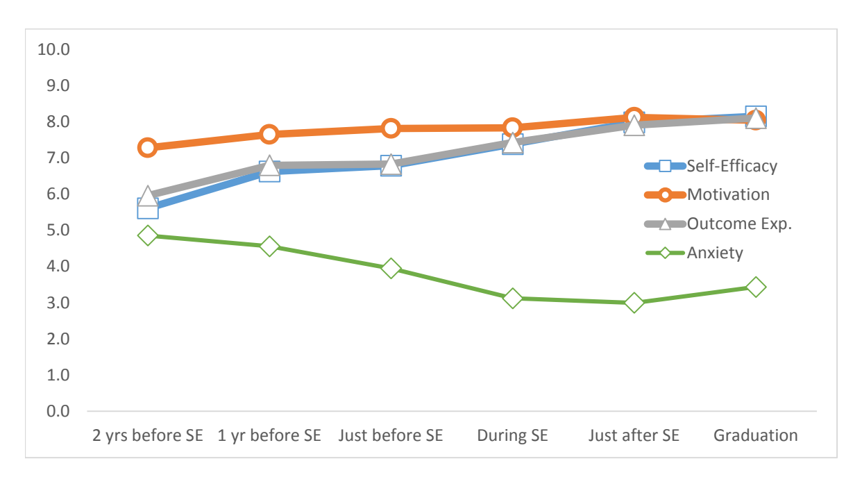
Figure 1: Mean response for each of the engineering design process questions by each year in the program relative to Servant Engineering. Data is from Table 1.