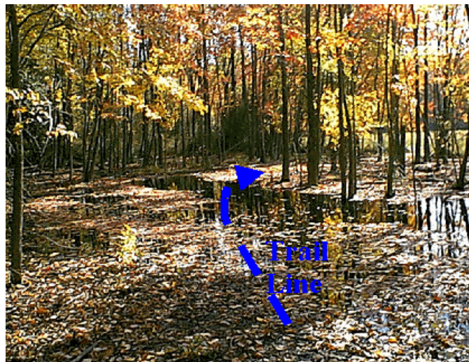
Figure 3. Example of Standing Water on Trails

The second and most substantial water site is located in the middle right component of the blue trail. The water at this location was approximately one to two feet deep. Figure 3 shows the start of the water site. Again, this volume of water was not dissipating, and two possibilities to combat this problem were to either eliminate the part of the trail or to build a bridge across. The water was located in an area of the trail between two outlets. A possibility would be to create a bypass by directing the blue trail out to the green trail and re-entering the blue trail after the water. As suggested earlier, a wooden footbridge could also be built across the water. However, some concerns arise in bridge building due to the considerable amount of debris from trees and tree limbs.