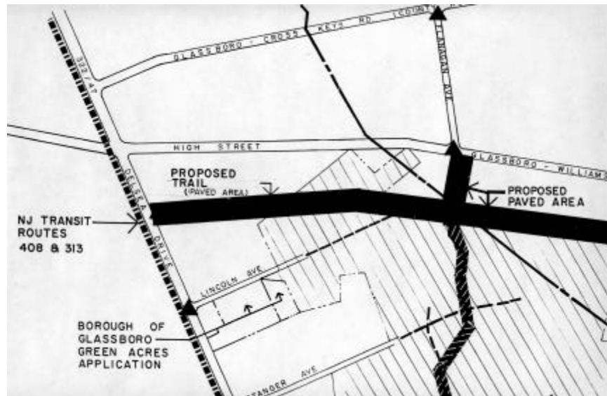
Figure 1. Rail-to-Trail Site

relevancy of this project to the university has also resulted in special student interest in the participation of the trail creation.