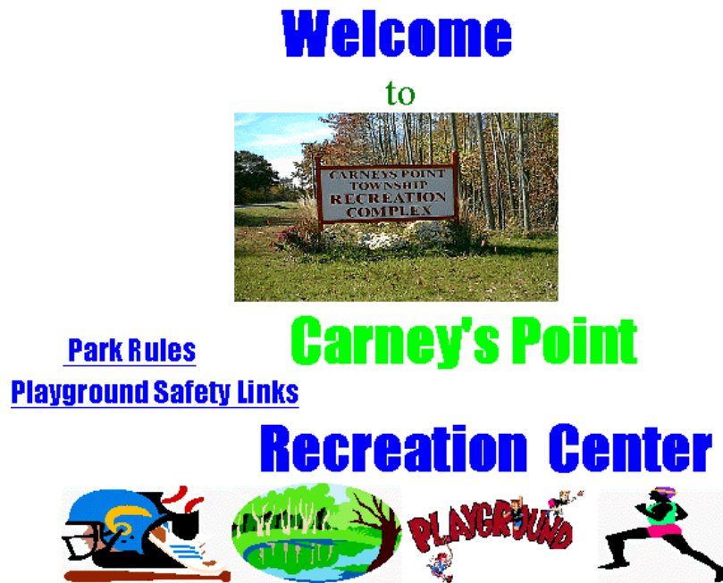
Figure 4. Carney's Point Recreation Center Web Site (excluding background graphics)

Team building was another important element of the engineering clinic. The team of three faculty and seven students were divided into subgroups pertaining to particular tasks or skills. One student was chosen to be the project coordinator, while the others were divided into the tasks of surveying/GPS, GIS, CAD, trail recommendations, environmental analysis, web design, and