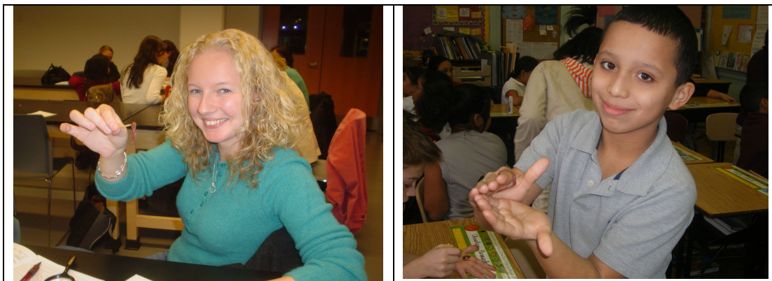
Figure 4: Students Working with Worms

Another follow-up workshop, “Developing Scientists in Your Classroom,” was held in December, 2007 and used the “study of the worms” to develop the inquiry approach to teaching and learning science. The teachers observed the worms, generated questions about the worms, planned and did investigations using the worms, and reported their findings. Their initial “yucks” turned into enthusiasm for the study of science. A number of teachers soon used the inquiry activity of using the worms to entice their students to learn. The teachers’ initial fear that their students would not like the study of the worms because of the “yuck” factor quickly vanished (Figure 4).