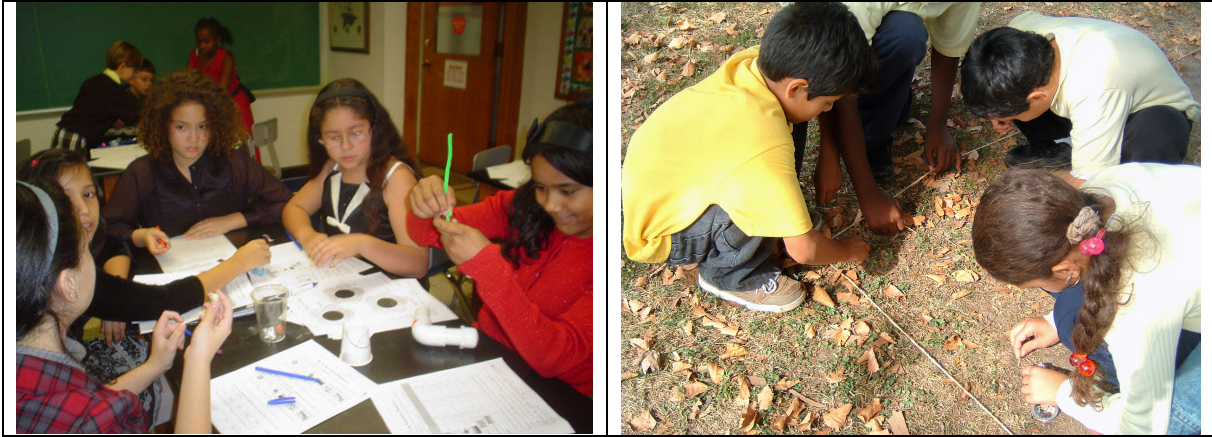
Figure 2: Students Design and Test Hand Pollinators

Another example is the “Water and the Environment” follow-up workshop held in October, 2007. The teachers learned the different properties of water, the different environmental factors that affect the environment and various techniques for how to teach these concepts to their students. In the following months, teachers used, adopted, and applied what they learned from the workshop in their classrooms. In one particular case, teachers in one school gathered all the Grades 3-5 students and asked them to work together to build four different watershed-friendly communities. The students worked as environmental scientists and engineers to build these four communities that were on top of the watershed. Students learned how to negotiate, compromise, study, plan, and work with each other and with other communities to preserve the water source and to use the water efficiently. They applied what they learned in science by deciding where to put the school, farm, factory, community, and others in their community with respect to the water source and the other communities (Figure 3).