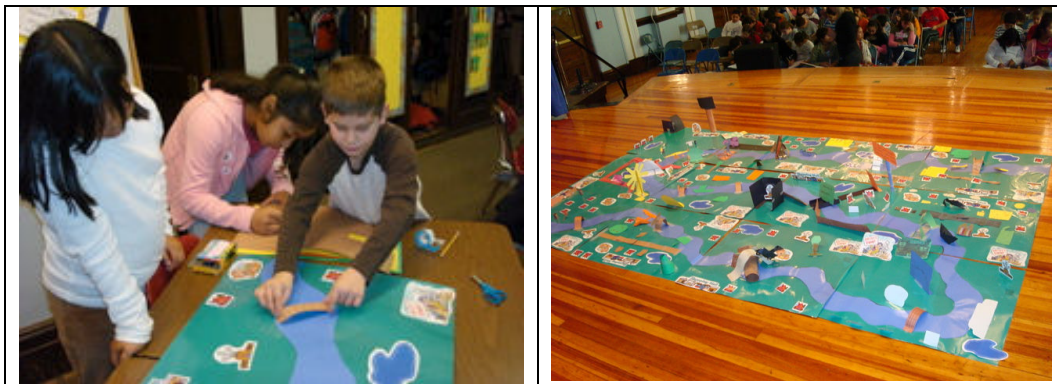
Figure 3: Students Build Communities within a Watershed

Another example is the “Water and the Environment” follow-up workshop held in October, 2007. The teachers learned the different properties of water, the different environmental factors that affect the environment and various techniques for how to teach these concepts to their students. In the following months, teachers used, adopted, and applied what they learned from the workshop in their classrooms. In one particular case, teachers in one school gathered all the Grades 3-5 students and asked them to work together to build four different watershed-friendly communities. The students worked as environmental scientists and engineers to build these four communities that were on top of the watershed. Students learned how to negotiate, compromise, study, plan, and work with each other and with other communities to preserve the water source and to use the water efficiently. They applied what they learned in science by deciding where to put the school, farm, factory, community, and others in their community with respect to the water source and the other communities (Figure 3).