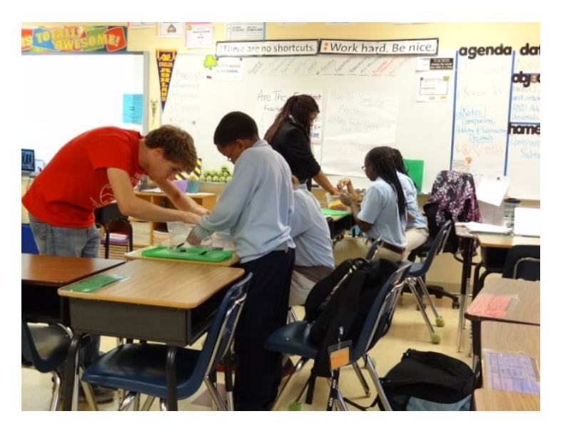
Figure 2. Engineering students leading middle students through an engineering design project.