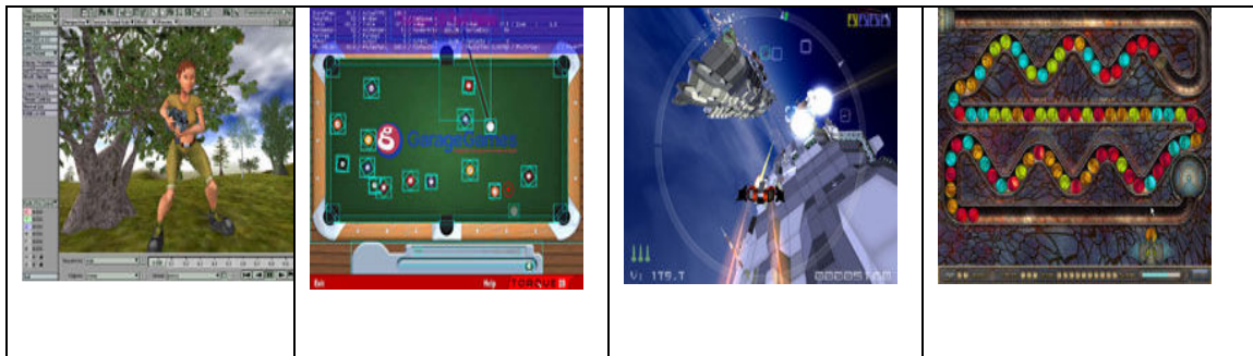
Figure 3. Examples of games developed using Mac OS X tools

usage. These tools are designed for serious game developers, but can also be used in classroom setting to help the students to understand important computer science concepts. In Figure 3, one example belonging to each game engine is shown.