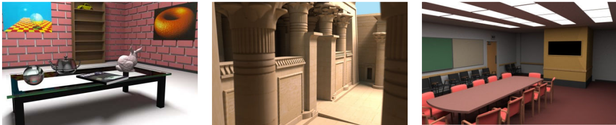
Figure 1: Image synthesis using ray tracing. The ray tracing algorithm supports complex visual effects that are not easily implemented with raster-based techniques, including depth-of-field, glossy and specular reflections, refraction, soft shadows, and diffuse interreflection.

The computer graphics research community has recently renewed its interest in ray tracing, an image synthesis algorithm that simulates the interaction of light with an environment to generate highly realistic images (Figure 1). Recent hardware trends and algorithmic developments make the technique competitive with raster-based algorithms, and some suggest that ray tracing will begin to dominate interactive rendering in coming years.