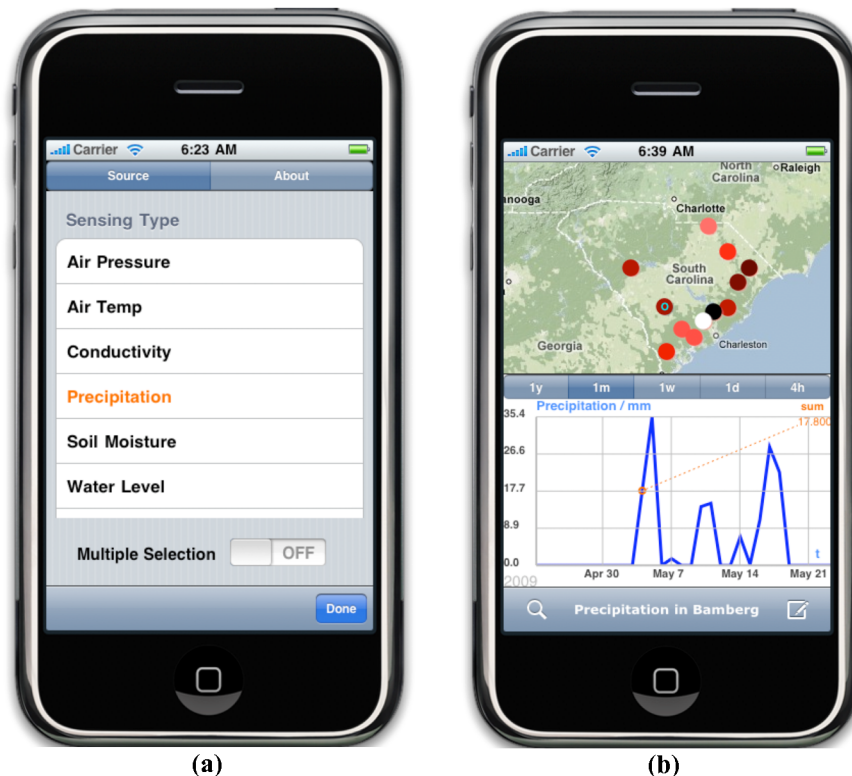
Figure 3: (a) Selecting sensing types from a list; (b) Visualizing precipitation data of a sensor in Bamberg, SC, USA

Sensor data visualization primarily involves rendering sensor distribution on the map and visualizing \langle \text{Sensor}, \text{Timestamp}, \text{Value} \rangle triples in line charts and tables. In Figure 3(b), red dots on the map denote the space distribution of only precipitation sensors available in the area. The darkness indicates different amount of rainfall during the period of Apr 24, 2009 to May 23, 2009. The line chart shows the time distribution of how precipitation fluctuated within a month, corresponding to the data in Table 1. The visualizations utilizing a map and a line chart help understand time-space distributional characteristics of environmental metrics. Users can also select more precise data views by looking at a table view that lists all time-value pairs numerically.