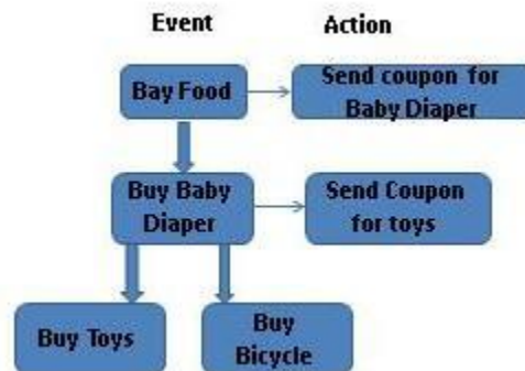
Fig. 2. The sequence of events and action recommendations in a customer shopping monitoring system.

Having such sequence presented, when a customer purchase baby food, we can predict that he will purchase baby diaper, toys and bicycle at some point in time.