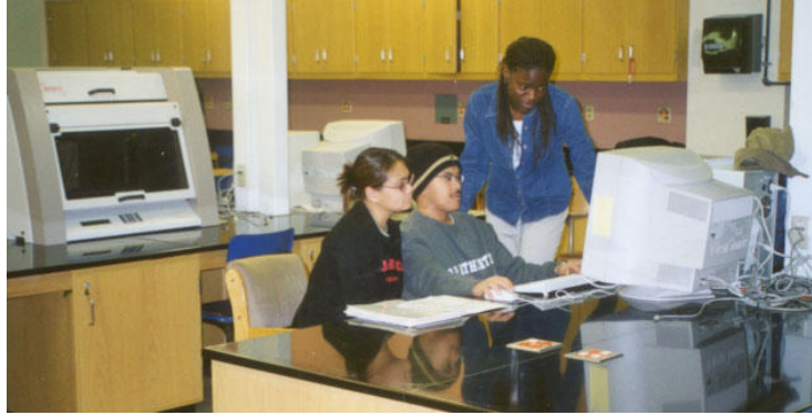
Figure1 Mechanical Design Lab

Internet so that students can search for information on the Web. Basic mechanical component catalogs such as those for gears, springs, bearings etc. are available on the shelves in the Lab. Rapid prototyping capability for model making was added to the Lab in the late Fall 2001. In addition, the Lab is also equipped with whiteboards and markers, benches, tables, and chairs, overhead projector and screen for group discussion and interaction. Figure 1 shows a project team working on their project in the Lab.