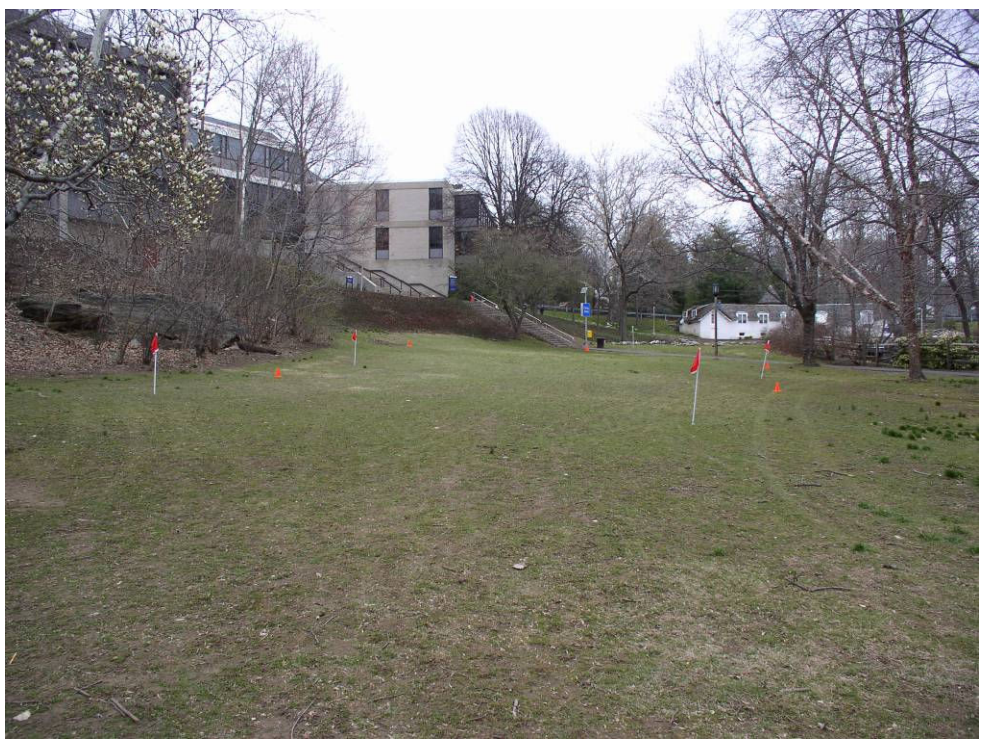
Figure 4: Off-path Field Crossing Area