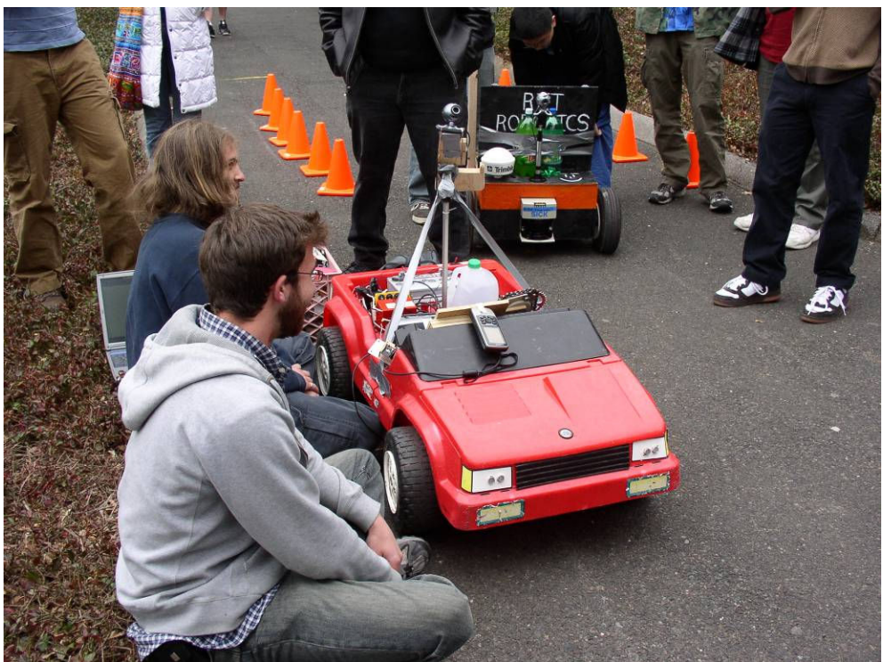
Figure 9: Participants in 2007 Mini Grand Challenge