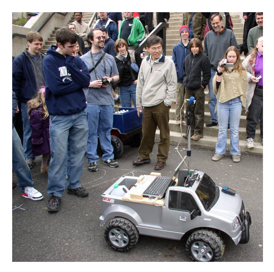
Figure 6: Penn State Abington Robot in 2007Contest