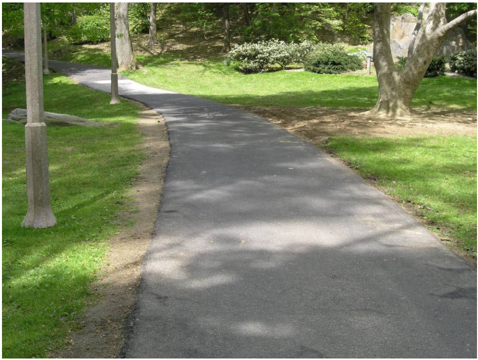
Figure 2: Campus Path Section