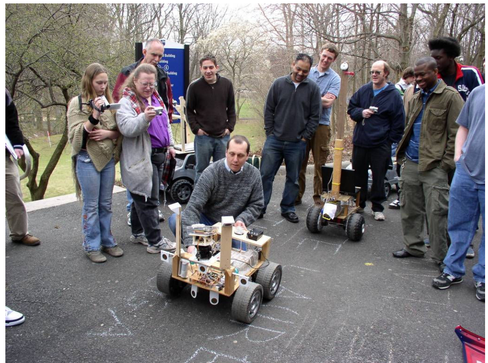
Figure 8: Participants in 2007 Mini Grand Challenge

It should also be noted that the Mini Grand Challenge robot contest does not require the use of the equipment and MATLAB software tools described above. Any hardware and software tools can be utilized to achieve a solution and it is hoped that the contest will support a variety of technical approaches based on a variety of educational goals. One of the advantages of allowing and encouraging a wide range of solutions is that students can benefit from exposure to a variety of creative approaches and technologies at the contest. A few of the other participating robots in the 2007 contest are shown below in Figures 8 and 9.