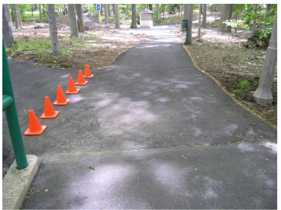
Figure 3: Campus Path Showing Orange Cones