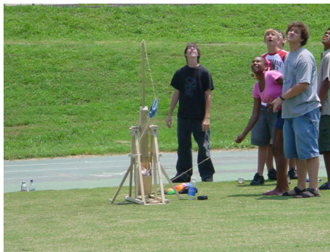
Figure 5: Testing Trebuchets

Each bridge was setup on the table shown in Figure 4. A bucket was suspended from the bridge. The bucket was slowly filled with water until the bridge collapsed. As shown in figure 4, the students enjoyed this test.