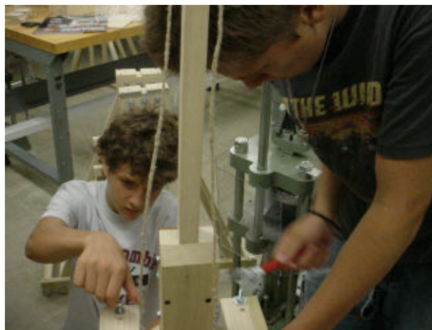
Figure 2: Students Building a Trebuchet

The second half of the day was an introduction to mechanical engineering through trebuchets. A trebuchet is a medieval military engine, similar to a catapult, and designed for hurling heavy missiles. The primary differences between trebuchets and catapults are: 1) the trebuchet uses counterweights instead of tension to power the machine, and 2) the trebuchet uses a sling to extend the length of the arm. There are a number of physics and mechanical engineering related decisions to be made in fine-tuning a trebuchet for its best performance.