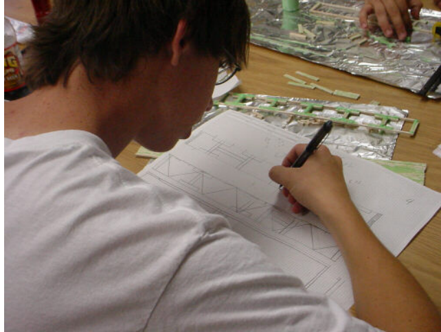
Figure 1: Designing & Building Bridges

The second half of the day was an introduction to mechanical engineering through trebuchets. A trebuchet is a medieval military engine, similar to a catapult, and designed for hurling heavy missiles. The primary differences between trebuchets and catapults are: 1) the trebuchet uses counterweights instead of tension to power the machine, and 2) the trebuchet uses a sling to extend the length of the arm. There are a number of physics and mechanical engineering related decisions to be made in fine-tuning a trebuchet for its best performance.