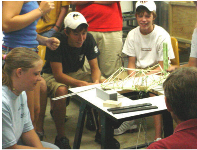
Figure 4: Testing Bridges to Destruction

The final day consisted of testing the bridges to destruction and hurling water balloons with the trebuchets.