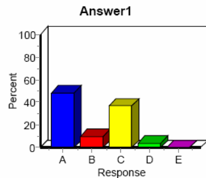
Figure 2: Example Pre-CI Report Displaying Test Statistics and a Single Item/Problem Analysis. The correct answer was ‘B’ for this question.

It should be noted that the post-course CI results serve as an opportunity for notifying faculty of specific content areas that may need strengthening in future classes. Additionally, faculty instructing subsequent courses will be made aware of potential fundamental knowledge weaknesses of incoming students.