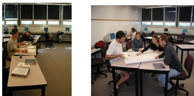
Figure 2 Students working in the ERE Design Studio in both the traditional and group work layouts.