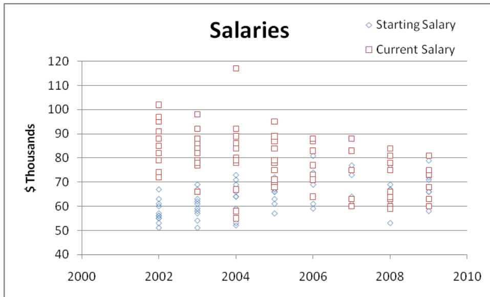
Figure 2. Self-reported Starting Salaries and Current Salaries for MS Graduates.