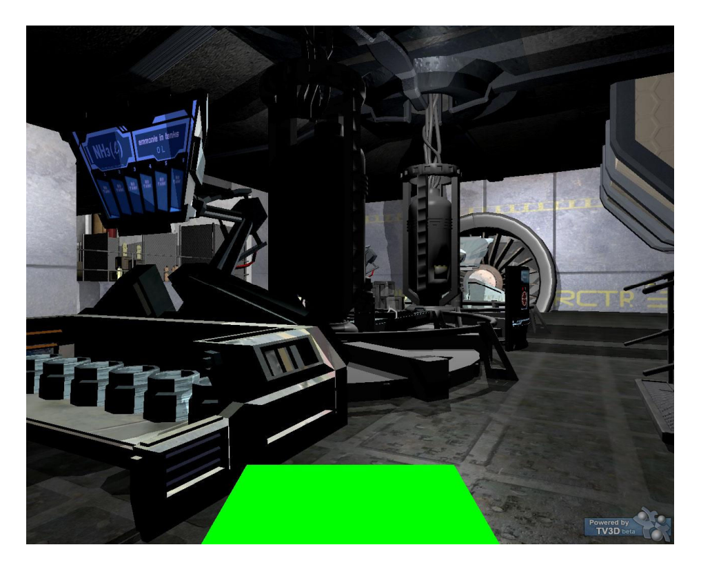
Figure 2. Game screen shot

positive feedback keeps the player satisfied. Figure 2 illustrates a scene from one of game-play tests in the ammonia reaction puzzle.