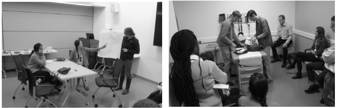
Figure 1. Engineering students and medical learners collaborating during a Medical Device Sandbox session.

Each session focused on use errors associated with two of the above six devices. Following the hands-on use simulation, BMEs and medical learners were divided into mixed groups of three to four to brainstorm novel solutions that address the use errors using low fidelity prototyping materials. The sessions concluded with the small groups coming together to share their ideas and discuss take-away lessons. Figure 1 shows students working during one of the Medical Device Sandbox sessions.