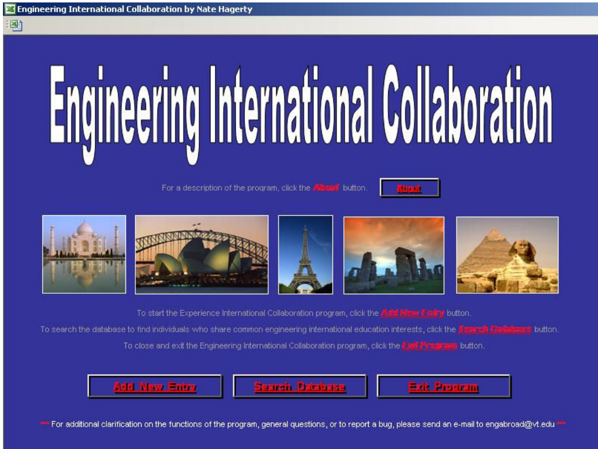
Figure 6: Front page of Engineering International Collaboration database for faculty input

The first initial populating process was handled by a student assistant after the Assistant Director spoke with department heads to let them know she would be emailing them a message to send to their faculty requesting this information. Some faculty chose to respond to this email and thus gave the initial input for the database. It will be an ongoing challenge to get the content for this database. This office is constantly learning on a day to day basis of what another faculty has done or is doing in another country. We haven't come up with a sure way to be able to capture everything that is happening internationally on the Virginia Tech engineering campus because the office has to rely on the faculty to keep us informed and they are busy. Figure 7 shows the input form.