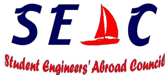
Figure 4: SEAC logo

of ages in the group. The one senior member seems to always have input while the freshman sit back and wait. Efforts are being made to provide more opportunities for the students to get together such as a trip to a Japanese restaurant before the end of the fall semester, breaking them up into smaller groups that have tasks associated with their booth at the spring Engineering Technology Showcase, and changing the president of the group for the spring semester. There were several students that were removed from the Council due to lack of meeting attendance or to not showing up at events at which they had volunteered to represent the Council. This will probably be an ongoing issue until the Council has established its guidelines and has a good structure in place for selecting its members. During this spring semester, SEAC will plan the first panel discussion event.