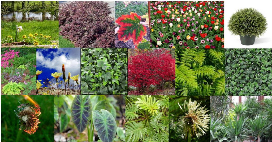
Figure 2: Other plant image samples

The student then tried to install TensorFlow on his own Mac. After a couple of unsuccessful trials, the student was able to installed TensorFlow using Docker. The student fine-tuned