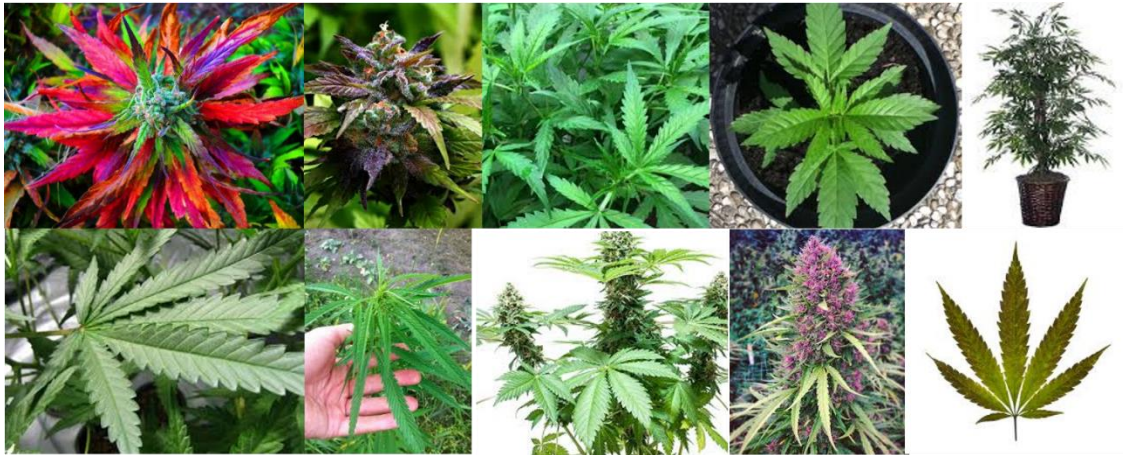
Figure 1: Marijuana image samples

In this project, the student explained his motivation of building an image based Marijuana classifier as follows: The US police investigators use helicopters to spot marijuana growing in rural fields or among other crops 14 , while a Marijuana classifier can be installed on a drone and make such process more efficient and cost-effective. The student downloaded 303 Marijuana images and 353 images of other plants from online using an image downloading tool called Fatkun Batch Download Image from Chrome web store (see Figure 1-2).