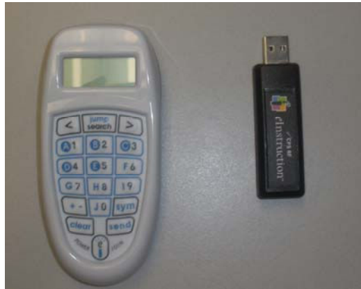
Figure 1: CPS response pad (pictured on left) and CPS USB receiver (pictured on right)